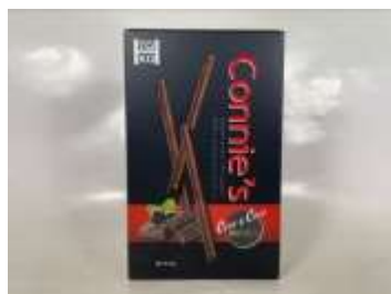
HT118 1.23oz x 24 CONNIE'S 巧克力味棒(18M) TOKO CHOCOLATE STICKS