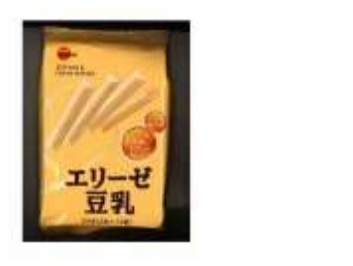
H023 2.98OZ X 6 X 2 80379 波本豆乳蛋卷(12M) BOURBON - ELISE TONYU