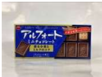
H354 2oz x 10 x 12 波本巧克力餅乾 (12M) ^BOURBON BAKED BISCUIT-MINI CHOCO (ALFORT)