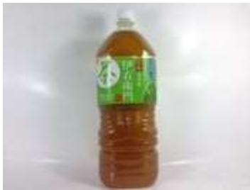
I031 2 L x 6 三多力伊右衛門綠茶 ( 2L ) (8M)

SUNTORY SOFT DRINK-GREEN TEA (L) (IEMON)