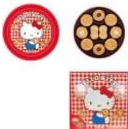
H473 11.5oz x 4 波本凱蒂貓餅乾禮品盒(12M)