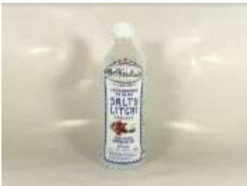
I241 500ml x 24 麒麟海鹽荔枝水 (12M) KIRIN SOFT DRINK - SALTY LYCHEE 500ml