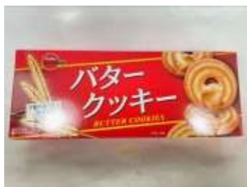
H096 3.1 oz x 12 x 4 波本黄油曲奇 (12M) BOURBON BUTTER COOKIES