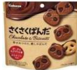
H464 1.65oz x 8 x 9 熊貓餅乾(12M)-巧克力