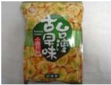
HT046 7.05OZ X 20 小圓煎餅(海苔口味)(12M) TOKO ROUND BISCUITS-SEAWEED