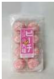
H132 7oz x 12 x 2 @蜜桃大福饼 KUBOTA BAKED SOFT CAKE - PEACH FLAVOR