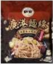
KT087 3.53oz x 30 @新宏鹿港麵線-老薑麻油風味

SHING HONG LUKANG THIN NOODLES - GINGER & SCALLION