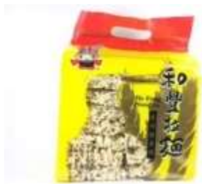
KT049 42.33oz x 12 @和豐拉麵 HE FONG DRIED NOODLE- RAMEN