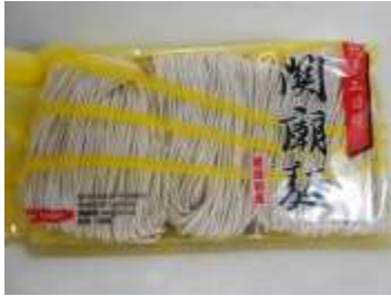
KT011 21.1 oz x 20 @東光關廟麵