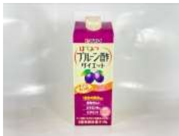
I172 500ML x 12 TAMANOI 濃縮李子果汁酢飲品500ML(12M) TAMANOI-VINEGAR DRINK CONCENTRATE (PRUNE)