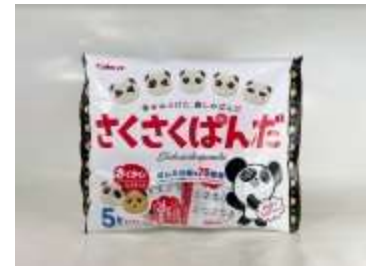
H466 2.99oz x 14 x 2 37495 熊貓餅乾家庭裝(12M)