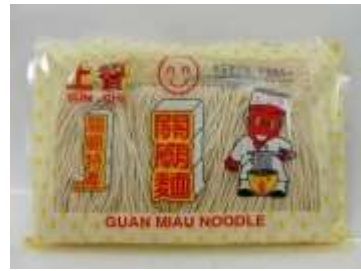
KT010 14 oz x 20 @上智關廟麵條 400g