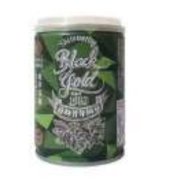
IT081 255ml x 24 仙草涼露(24M) GRASS JELLY JELLO