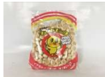
H375 2.0 OZ X 15 X 2 @ 營養小饅頭 (小雞) IWAMOTO TAMAGO EGG BORO BISCUIT