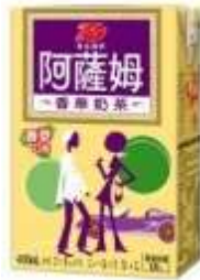
IT046 (400ML x 6) x 4 阿薩姆香草奶茶 12M