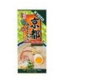
K133 6.42OZ X 12 京都大豆醬豬排 (12M)