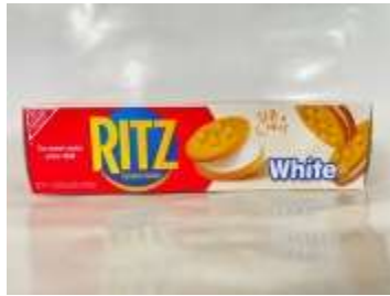
HK031 2.72oz x 24 香草夾心餅乾(12M) NABISCO RITZ SANDWICH CRACKER WHITE