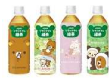
I233 500ML X 24 DYDO 輕鬆熊綠茶(10M) DYDO RILAKKUMA GREEN TEA