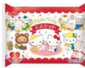
H285 3.7oz x 18 x 2 13431 Hello Kitty 餅乾(10M) ITO HELLO KITTY BISCUIT