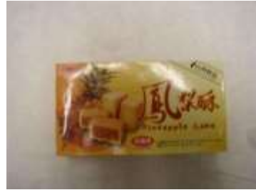
HT052 7.05 oz x 20 @友賓鳳梨酥盒裝 PINEAPPLE COOKIE (BOX PACKED)