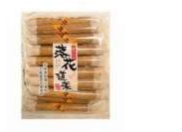
H196 5.6OZ X 12 X 2 @落花道樂 16本 KIKUSENDO WHEAT CRACKER - PEANUT 16P