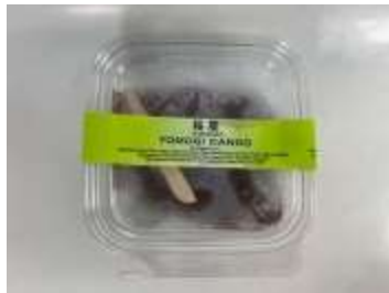
HA016 4.5 oz x 12 x 2 @桜屋艾草団子(9pcs) *SAKURAYA YOMOGI DANGO