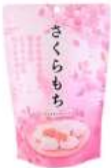
H066 4.58OZ X 12 @精機櫻花大福 SEIKI MOCHI - SAKURA MOCHI