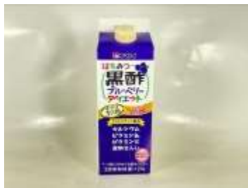
I173 500ml x 12 TAMANOI 濃縮藍莓果汁黑酢飲品500ML(12M) TAMANOI-BLACK VINEGAR DRINK CONCENTRATE(BLUEBERRY)