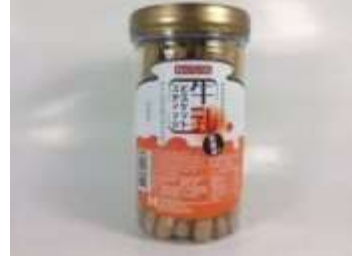
HT073 8.10 oz x 12 @長松松屋黑糖棒(奶蛋素) CHANG SONG MATSUYA BISCUIT- BROWN SUGAR FLAVOR