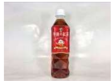
I012 500 ml x 24 麒麟午後紅茶 (原味)(12M) KIRIN SOFT DRINK- TEA-STRAIGHT (S)