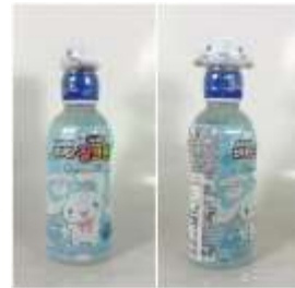
IK050 220ml x 24 5272 三麗鷗玉桂狗飲料 (蘇打水) (18M) SANRIO CINNAMOROLL DRINK (SODA)