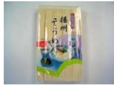
K102 35.27 oz x 9 播州壽麵 (30M)

IBONOTAKI DRIED NOODLE S 1kg (BANSYU SOMEN)