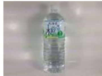
I136 2L x 6 北海道礦泉水(24M)

HOKKAIDO MINERAL WATER 2L (SUISAINOMORI)