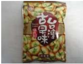
HT047 7.05OZ X 20 味良野(海苔口味)(12M) TOKO WEI LIANG YI-SEAWEED COOKIES