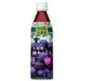
I162 430 ml x 24 麒麟葡萄果汁470ml(9M) KIRIN SOFT DRINK- KOIWAI GRAPE(S)