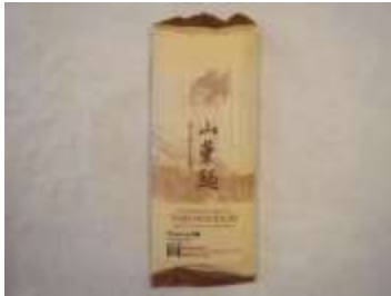
KT110 8.81oz x 30 @琦家陽明山山藥麵-拉麵(12M)