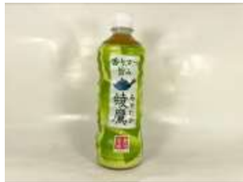
I102 525ml x 24 可樂綠茶 (500ML) (8M)

COCA COLA SOFT DRINK-GREEN TEA (AYATAKA) (S)