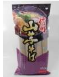
K005 15.8 oz x 24 @山芋蕎麥麵 (YAM SOBA) (12M)