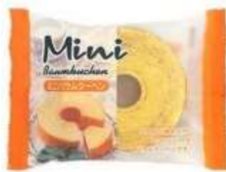
H271 2.8OZ X 30 @迷你千層蛋糕 - 原味 MINI BAUMKUCHEN - ORIGINAL