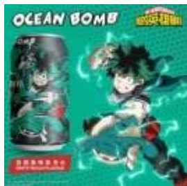
IT004 330ml x 24 白桃风味气泡水(24M) OCEAN BOMB IZUKU MIDORIYA WHITE PEACH FLAVOR