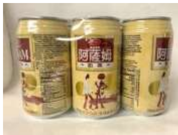
IT038 (340ml x24) 阿薩姆奶茶(罐裝)(24M)