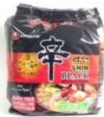
KK033 (4.58oz x 4) x 4 101004261農心 黑色辛拉麵 (12M) N.S. SHIN RAMYUN BLACK (16)(4F-PK)