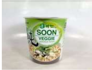
KK099 2.64oz X 6 101002859 農心素食杯麵(12m) NONGSHIM SOON VEGGIE CUP 6