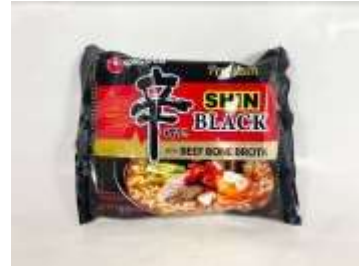
KK021 4.58oz x 10 101003015 農心韓國黑拉麵(12M) N.S. SHIN RAMYUN BLACK (10PK)