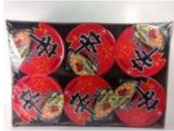
KK020 2.64oz x 6 101003241 農心 辛杯面 (12M) N.S. SHIN CUP (6PK)