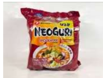
KK017 (4.2oz x 4) x 4 101002717 農心韓國香辣海鮮烏冬面(12M) N.S. NEOGURI SPICY SEAFOOD (16)(4F- PK)