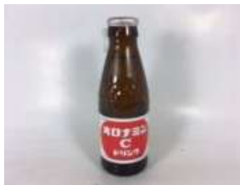
I037 (120ML X 10) X 5 大家VC飲料(12M)