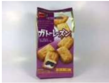
H339 2.9oz x 10 x 2 35279 波本法式饼干-葡萄(6M) ^BOURBON COOKIES- GATEAU RAISIN