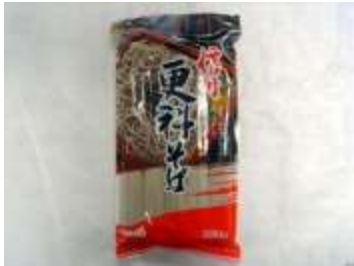
K003 15.8oz x 24 蕎麥麵 (SOBA) (12M)