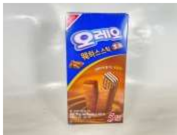
HK027 2.64oz x 24 奧利奧巧克力威化(12M) ^NABISCO OREO CHOCO WAFER