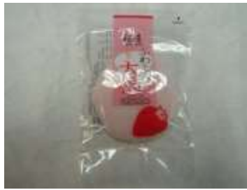
HA010 2.8oz x 20 x 2 @大福餅-紅 (草莓單個) *SAKURAYA FUWA FUWA STAWBERRY