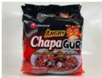
KK045 (4.9oz x 4) x 8 101005120 農心香辣炸醬和海鮮味(12M) N.S. ANGRY CHAPAGURI - SPICY JAJANG (SEAFOOD)(32)