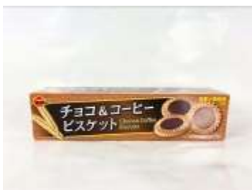
H091 3.81 oz x 12 x 4 波本巧克力咖啡餅干 (12M) ^BOURBON CHOCO & COFFEE BISCUIT