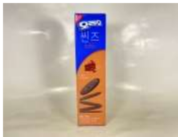
HK026 2.96oz x 24 奧利奧薄片 (巧克力慕斯) (12M) NABISCO OREO THINS (CHOCOLATE MOUSSE)