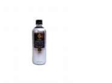
I038 600ml x 24 麒麟一日黑咖啡(無糖)(12M)