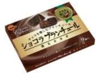
H368 1.41OZ X 10 X 12 波本巧克力餅乾-可口口味(12M) ^BOURBON-CHOCOLAT BLANCHUL KAORU CACAO