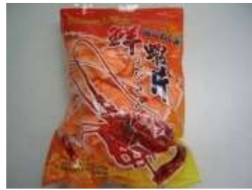
HT048 5.29oz x 10 @穎成鮮蝦片 Y.C. SHRIMP FLAVORED CRACKER-ORIGINAL