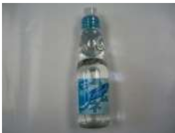
I056 200ML x 30 @原味彈珠汽水 FUJI SODA - ORIGINAL (RAMUNE)