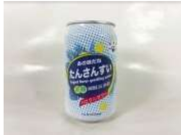
IT091 330 ML X 24 乳酸風味气泡水(24M) YOGURT FLAVOR SPARKLING WATER