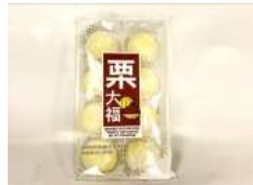
H011 7oz x 12 x 2 @栗子大福饼

KUBOTA BAKED SOFT CAKE - CHESTNUT FLAVOR