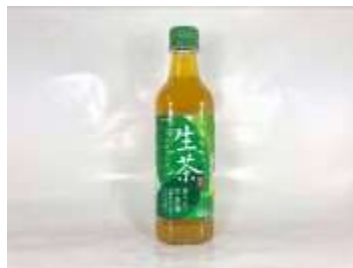
I059 525ML x 24 麒麟 ) (8M) 麟生茶 (小) KIRIN SOFT DRINK - TEA (NAMA CHA) (S)