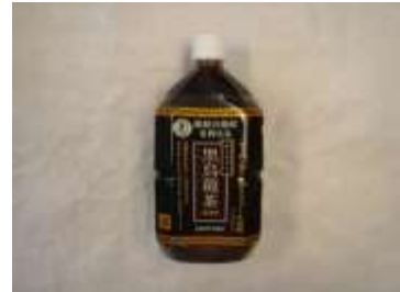
I191 1.05L x 12 三多力黑烏龍茶1L (12M) SUNTORY SOFT DRINK BLACK OOLONG TEA