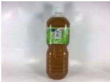
I101 2L x 6 可樂綠茶 (2L) (8M)

COCA COLA SOFT DRINK-GREEN TEA (AYATAKA) (L)