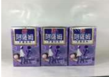
IT050 (400ML X 6) X 4 阿薩姆香芋奶茶 (12M)