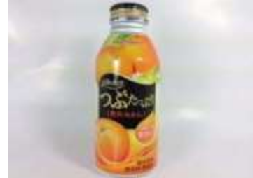
I077 400ml x 24 三寶樂橘子水(有果粒) (9M) POKKA SAPPORO- Orange Juice 400ml