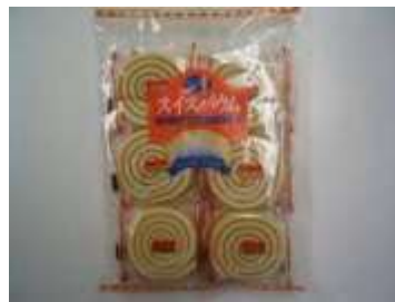
H272 5.3oz x 12 @蛋糕捲 DAISHO BAKED CAKE (SWISS BAUM)