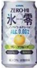
I007 350ML x 24 麒麟零酒精啤酒-葡萄柚口味(12M) KIRIN ZERO HI SOFT DRINK-GRAPEFRUIT 350ml