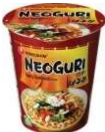
KK041 2.1oz x 6 101003359農心韩国乌冬冬面杯麵(10M) N.S. NEOGURI CUP SPICY SEAFOOD (6PK)