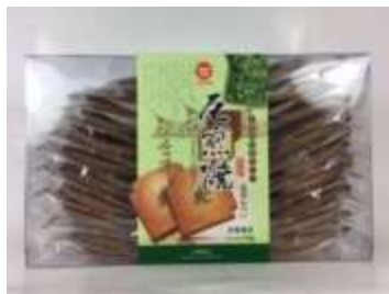
HT004 8.11oz X 12 @瓦煎燒透明盒-海苔味 YEOU BIN CRACKER - SEAWEED FLAVOR