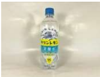
I036 500ML X 24 麒麟檸檬水- 無糖 (7M)