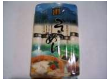
K033 1 KG x 12 乐市面线 (24M) AOI DRIED FLOUR NOODLE (KOHBOH SOMEN)