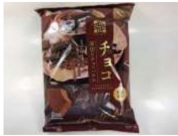
H185 7.4oz x 9 @切片千層糕-巧克力 MARUKIN BAUM CAKE- CUT (CHOCOLATE)