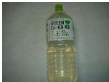
I252 2L x 6 SUNTORY運動飲料水 2L (11M) SUNTORY SOFT DRINK - (GREEN DAKARA) 2L