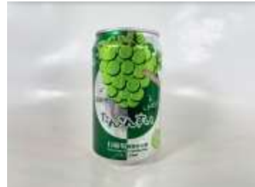
IT092 330 ML X 24 白葡萄風味气泡水 (24M) GREEN GRAPES FLAVOR SPARKLING WATER