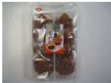
H213 10.5 oz x 8 @廣島名產楓葉饅頭 KOTOBUKI SWEET BEAN CAKE (HIROSHIMA MOMIJI)