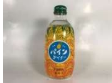
I161 300ML X 24 水果飲料-菠蘿(18M) TOMOMASU PINE CIDER 300ML