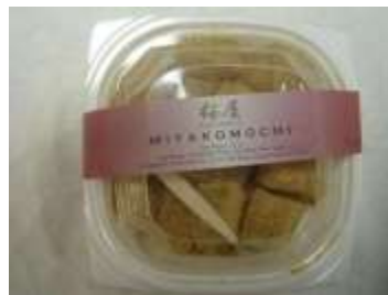
HA007 4.5oz x 12 x 2 @櫻屋 宮古餅