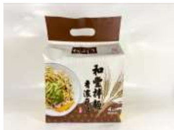
KT050 (4.3oz x 4) x 8 @和豐拌面香浓麻醬 HE FONG DRIED NOODLE- SESAME SAUCE