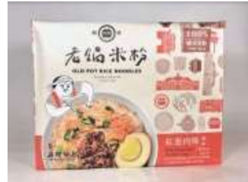
KT122 (2.29OZ X 4) X 6 @老鍋米粉-紅蔥肉燥家庭包4入