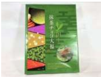
H073 13.75oz x 16 @精機绿茶巧克力大福600G SEIKI MOCHI- DAIFUKU GREEN TEA WITH CHOCOLATE600G