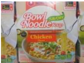
KK002 3.03oz x 12 101002186農心韩国雞碗面(12M)