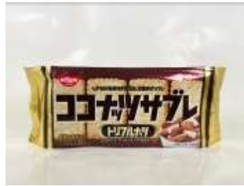
H256 3.1oz x 12 30077 日新CISCO 坚果饼干 (椰果·榛子·杏仁) (12M) NISSIN CISCO'S COCONUT SABLE-TRIPLE NUTS BISCUIT