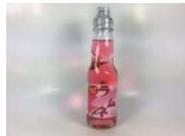
I060 200ML x 30 949 @草莓彈珠汽水 FUJI SODA - STRAWBERRY (RAMUNE)