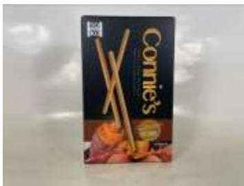
HT120 1.23oz x 24 CONNIE'S 地瓜牛奶巧克力味棒(18M) TOKO SWEET POTATO MILK CHOCO STICK