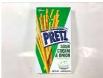
HTI001 1.09 OZ X 10 X 12 固力高百力枝-酸奶油和洋葱味棒(12M) GLICO PRETZ BAKED BISCUIT SOUR CREAM AND ONION