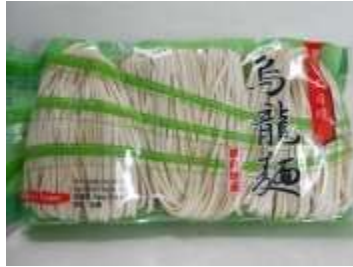
KT012 17.6 oz x 20 @東光烏龍麵 (九片裝)