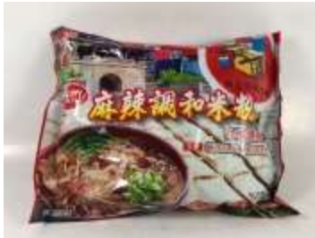
KT036 2.47OZ X 30 新竹調和沖泡米粉 - 麻辣 (12M)

SPICY BLENDED (MALA) INSTANT RICE NOODLES