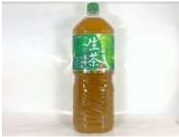
I028 2L x 6 麒麟生茶 (2L) (9M)

KIRIN SOFT DRINK-FRESH GREEN TEA (NAMA CHA) (L)