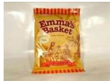
H030 6 oz. x 18 枇杷条(12M) SHIGA BISCUIT