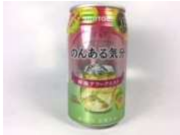
I187 350ml x 24 三多力无酒精饮料 - 梅子 (12M) SUNTORY SOFT DRINK-PLUM FLAVOR