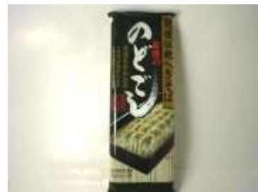
K028 9.52oz x 15 自然芋-布海苔麵(12M) HEGI SOBA JAPANESE NOODLE (NODOGOSHI)