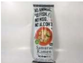
K131 7.7oz x 24 武士拉面-全素 (12M)

HIGASHIMARU NOODLE - SAMURAI RAMEN (VEGAN)