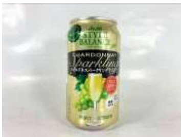
I009 350ml x 24 朝日無酒精飲料-白葡萄味350ml (12M) ASAHI NON-ALCOHOL DRINK-CHARDONNAY FLAVOR