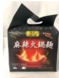
KT016 (4.3OZ X 4) X 6 @寧記麻辣火鍋麵