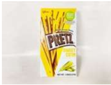
HTI004 1.09 OZ X 10 X 12 GU15311 固力高百力枝 - 甜玉米棒(12M) GLICO PRETZ BAKED BISCUIT SWEET CORN