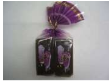
J003 12.5 oz. x 12 x 2 @一口羊羔--黄