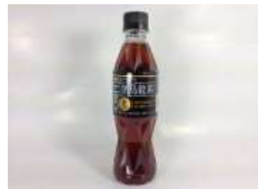
I181 350ML x 24 三多力黑烏龍茶(12M) 350ml SUNTORY SOFT DRINK-BLACK OOLONG TEA