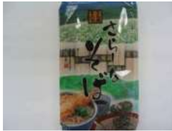
K031 1KG x 12 乐市荞麦麵 (18M) AOI DRIED BUCKWHEAT NOODLE (KOHBOH SOBA)