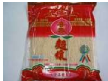
KT083 21.1 oz x 12 @幸福壽麵線 HANG-SHANG DRIED NOODLE