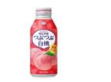
I116 380ml x 24 不二家飲料 (白桃) (9M)