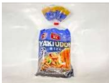
K047 23.91 oz x 12 铁板酱油乌冬麵(12M) ITSUKI ANIMAL FREE YAKI UDON NOODLE 3P (SOYSAUCE)