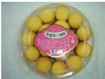
HT057 16.58oz x 12 @友賓小鳳梨酥-蔓越梅 PINEAPPLE COOKIE - CRANBERRY