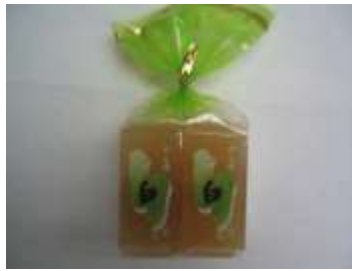
J002 12.5 oz. x 12 x 2 @一口羊羔--绿

KASHIHARA JELLY CANDY (YOKAN/SHIRO-NERI)