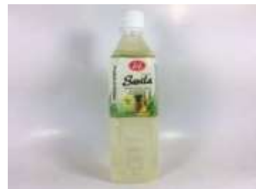
IK036 500ml x 20 韓國蘆薈實鳳梨500ml(24M)