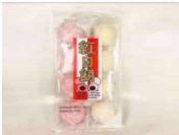
H009 7oz x 12 x 2 @美味红白大福饼