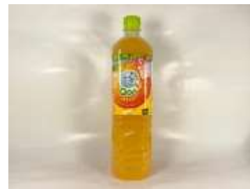
I121 950mlx12 可樂Q系列橘子汁 (大) (10M)