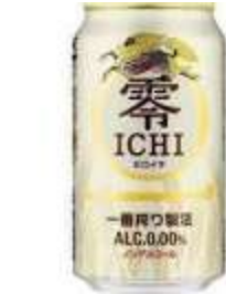
I005 (350ML x 6) x 4 麒麟無酒精啤酒(12M) KIRIN ICHI SOFT DRINK 350ml (0.00% ALC)