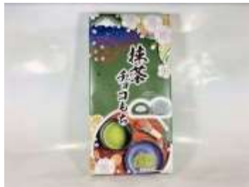
H084 8.25oz x 21 @精機绿茶巧克力大福 SEIKI MOCHI-DAIFUKU GREEN TEA WITH CHOCOLATE