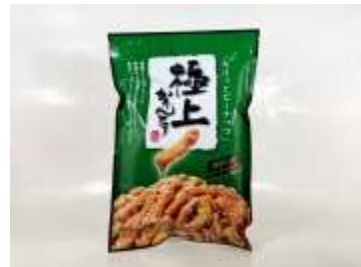
H159 4.4oz x 12 x 2 极上花生脆条(3M) Y. YAMAWAKI BAKED WHEAT BISCUITS- PEANUTS (KARINTO)