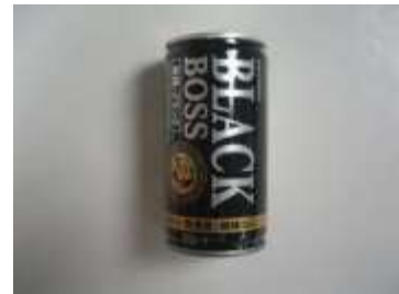
I033 6.5 oz x 30 波士黑咖啡 (小) (12M)