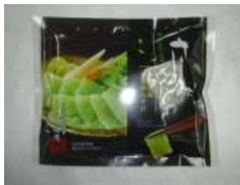
K018 4.2 oz x 10 山藥麵條-紫蘇 (10M) ISHIBASHIYA YAM NOODLE PERILLA(SASHIMI KONNYAKU)