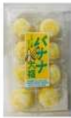
H061 7oz x 12 x 2 @香蕉大福餅 KUBOTA BAKED SOFT CAKE - BANANA