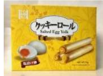
HT113 2.64OZ X 24 鹹蛋黃甜心爆爆捲(15M) TOKO SALTED EGG YOLK COOKIE ROLLS