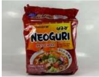
KK050 (4.2oz x 4) x 8 101004870 農心韓國香辣海鮮烏冬面(12M) N.S. NEOGURI SPICY SEAFOOD(32)(4F- PK)