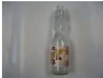
I053 200ML x 30 @荔枝彈珠汽水 FUJI SODA - LYCHEE (RAMUNE)