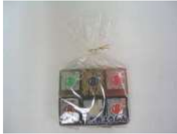
J007 14.8 oz x 12 x 2 @羊羹 (综合)