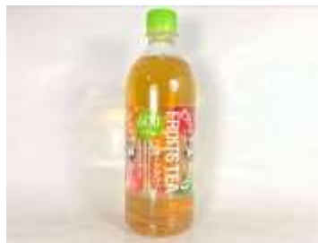
I083 600ml x 24 三多力工藝老蘭水果茶(10M)