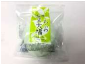
HA018 2.8oz x 20 x 2 @大福餅-綠茶 (單個) *SAKURAYA FUWA FUWA GREEN TEA(MATCHA)