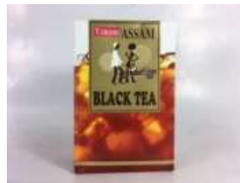
IT039 (400ML x 6) x 4 阿薩姆紅茶12M