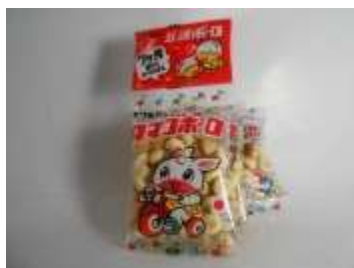
H057 (0.5 oz x 5) x 30 @五连营养小饅頭