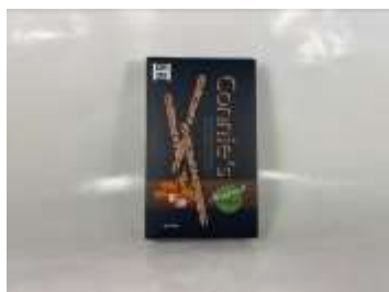
HT117 1.05oz x 24 CONNIE'S杏仁牛奶巧克力味棒(18M) TOKO ALMOND MILK CHOCOLATE STICKS