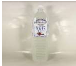
I242 1.5 L x 8 麒麟海鹽荔枝水 (12M) KIRIN SOFT DRINK - SALTY LYCHEE 1.5L