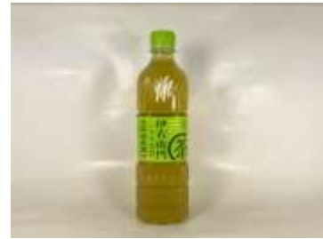
I030 600ml x 24 三多力伊右衛門綠茶 600ml (8M)

SUNTORY SOFT DRINK-GREEN TEA (S) (IEMON)