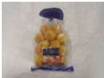
H175 9oz x 10 @家庭蛋糕 (15P) MARUKIN MUFFIN (15p) (FAMILY CAKE)