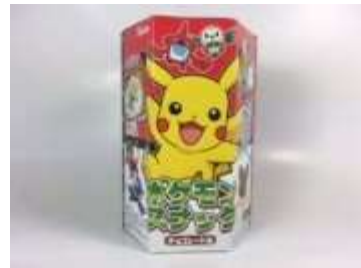
H130 0.81oz x 6 x 8 07045东鸠口袋妖怪 - 巧克力牛奶饼干 (8M) TOHATO BISCUIT- CHOCOLATE (POKEMON)