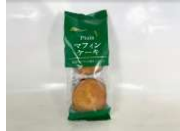
H190 3.5oz x 12 @MARUKIN蛋糕原味 2P MARUKIN MUFFIN -PLAIN (2P)