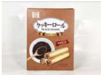
HT114 2.64OZ X 24 黑芝麻甜心爆爆捲(15M) TOKO BLACK SESAME COOKIE ROLLS