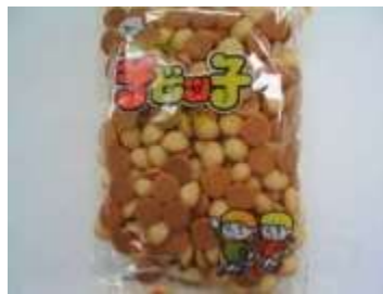
H032 3.88 oz x 30 @鸡蛋小饼