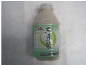
IT029 330 ml x 24 正康黑豆漿(12M)