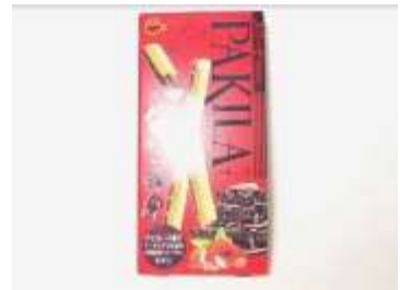
H090 1.60oz x 10 x 8 波本巧克力蛋卷(10M) ^BOURBON PAKILA - CHOCOLATE BISCUIT