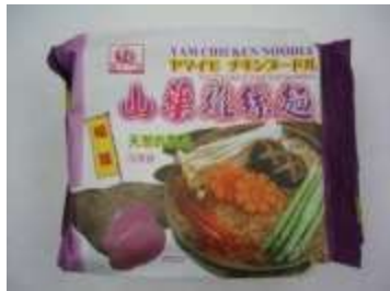
KT001 5.2 oz x 12 @福慧山藥雞絲麵 VEGETARIAN INSTANT NOODLE (YAM) 2P