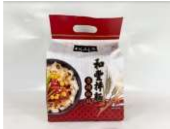
KT044 (3.77oz x 4) x 8 @和豐拌面香辣椒麻