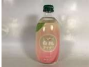
I158 300ML X 24 水果飲料-水蜜桃(18m) TOMOMASU PEACH CIDER 300ML