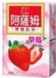
IT043 (400ML x 6) x 4 阿薩姆草莓奶茶 12M