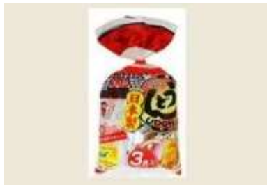
K036 22.1oz x 12 烏冬麵3P&湯(12M) UDON 3P & SOUP SET