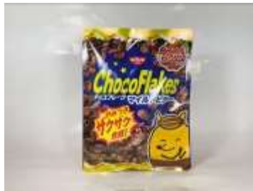
H262 2.29oz x 12 x 2 12621 日新 CISCO濃巧克力薄片小餅乾 - (13M) ^NISSIN CISCO'S BAKED CHOCO CORN FLAKE-MILD BITTER