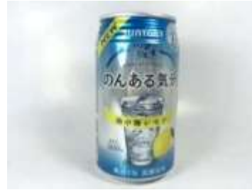
I185 350ml x 24 三多力无酒精饮料 - 柠檬 (12M) SUNTORY SOFT DRINK-LEMON FLAVOR