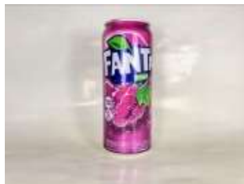
I108 500ml x 24 FANTA 葡萄汽水 (12m)