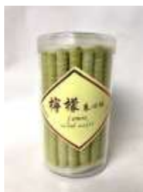
HT029 7.76OZ X 12 @傅林卷心酥-檸檬口味 FULIN ROLLED BISCUIT - LEMON