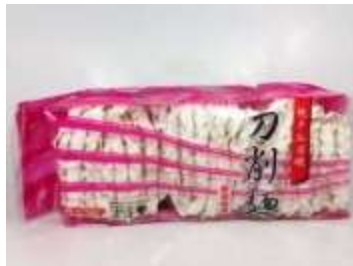
KT015 17.6 oz x 20 @東光刀削麵 (九片裝)