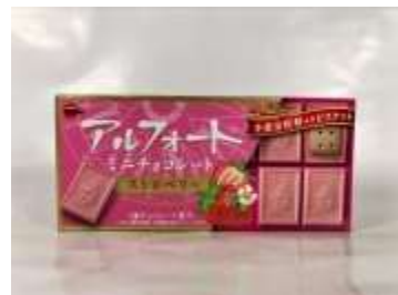
H329 1.9oz x 10 x 12 波本草莓餅乾 (12M) ^BOURBON BISCUIT - MINI STRAWBERRY (ALFORT)