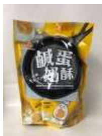
HT034 7.62oz x 10 @正福堂鹹蛋奶酥 CHENG FU TANG SALTED EGG CRISP