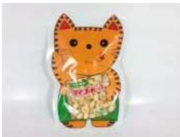
H025 1.7oz x 20 @卡通营养小饅頭 (小猫咪) IWAMOTO JUNIOR BABY BISCUIT (KITTY) BORO