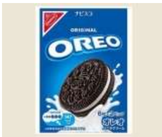
H436 3.45oz x 12 奧利奧夾心餅乾-香草 (12M)