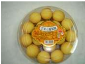
HT058 16.58oz x 12 @友賓小鳳梨酥-芒果 PINEAPPLE COOKIE - MANGO