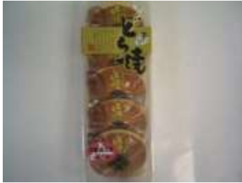
H006 12.5 oz x 8 @北海道栗子铜锣烧