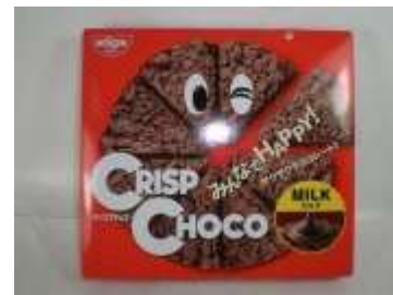
H250 1.7 OZ X 12 日新CISCO餅乾-牛奶(12M) ^NISSIN CISCO'S BISCUIT - CRISP MILK CHOCO