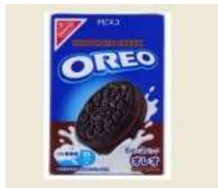
H437 3.45oz x 12 奧利奧夾心餅乾-巧克力 (12M)