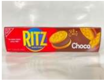
HK032 2.72oz x 24 巧克力夾心餅乾(12M) NABISCO RITZ SANDWICH CRACKER CHOCOLATE