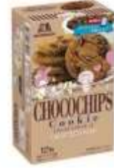
H454 3.9oz x 5 x 8 森永巧克力豆餅乾 (9M)