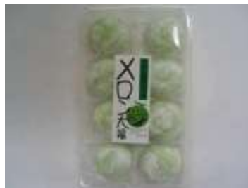
H013 7oz x 12 x 2 @蜜瓜大福饼