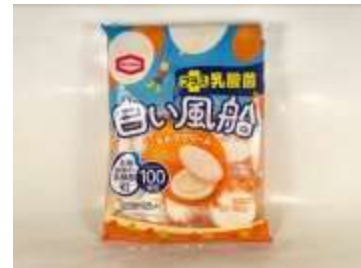
H266 2.32oz x 12 龟田白色气奶油 (5M) KAMEDA SHIROI FUSEN MILK CREAM