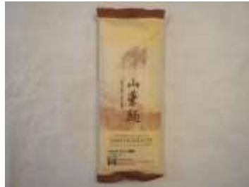
KT111 8.81oz x 30 @琦家陽明山山藥麵-麵線(12M)

CHIEF HOUSE CHINESE YAM NOODLES- ANGEL HAIR