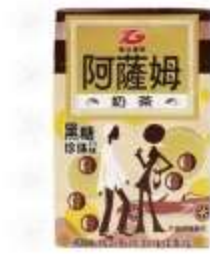
IT049 (400ML x 6) x 4 阿薩姆黑糖奶茶 12M