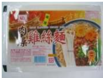
KT004 10.5 oz x 12 @福慧肉燥雞絲麵 VEGETARIAN INSTANT FINE NOODLE (ONION) 5P