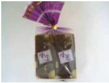
J001 12.5 oz x 12 x 2 @小倉羊羹