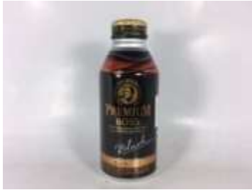
I089 390ML x 24 三多力尊享黑咖啡(12M)