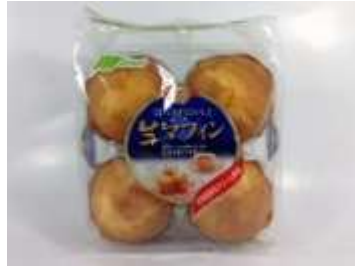
H189 8.1oz x 8 @MARUKIN蛋糕 4P MARUKIN MUFFIN 4P