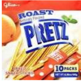
HTI045 (6.35oz x 5) x 8 GU15312 固力高百力枝-烘烤 (聚会包)(12M) GLICO PRETZ PARTY PK- ORIGINAL (SALAD)