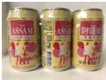
IT037 (340ml x24) 阿薩姆草莓奶茶(罐裝) (24M)