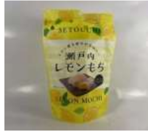
H064 4.58oz x 12 @精機檸檬麻糬 SEIKI MOCHI - LEMON