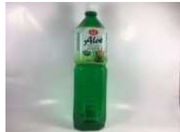
IK033 1.5L x 12 韩国蘆薈實 1.5L (24M)