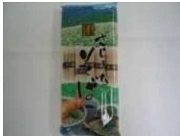
K075 14.1 oz x 20 乐市荞麦面 (18M) AOI DRIED BUCKWHEAT NOODLE(KOHBOH SOBA)