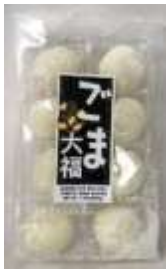
H016 7oz x 12 x 2 @芝麻大福饼