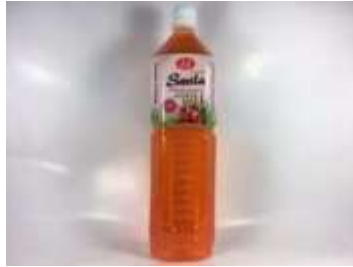
IK043 1.5L x 12 韓國蘆薈寶石榴1.5L(24M) L&L ALOE DRINK - POMEGRANATE(1.5L)