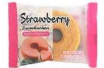
H268 2.8OZ X 30 @迷你千層蛋糕 - 草莓 MINI BAUMKUCHEN - STRAWBERRY FLAVOR