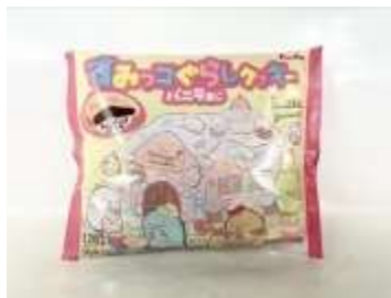
H101 4.44OZ X 16 X 2 古田-角落小夥伴餅乾香草味(10M) FURUTA SUMIKKO GURASHI COOKIE VANILLA