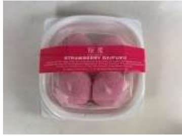
HA013 4.5oz x 12 x 2 @大福餅-草莓 (4pcs) *SAKURAYA DAIFUKU -STRAWBERRY