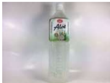
IK035 1.5L x 12 韓國蘆薈實椰果 1.5L(24M)