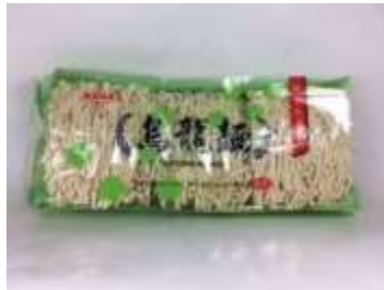
KT052 17.64oz x 20 @東光烏龍面-500G T.D.G DRIED NOODLE- WU LUNG STYLE(500G)