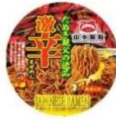
K063 2.53OZ X 12 X 2 山本碗面-辣拌麵(6M) YAMAMOTO INSTANT NOODLE- SPICY MIXED RAMEN