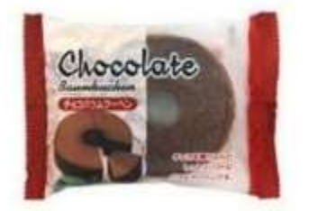
H269 2.8OZ X 30 @迷你千層蛋糕 - 巧克力 MINI BAUMKUCHEN - CHOCOLATE FLAVOR