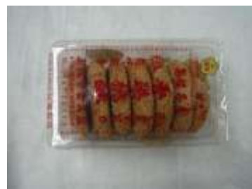
HT037 6.17oz x 20 @正福堂香港桃酥 CHENG FU TANG HONGKONG CRISP COOKIE