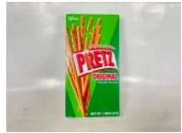
HTI006 1.09oz x 10 x 12 GU15305 固力高百力枝-原味棒 GLICO PRETZ BAKED BISCUIT ORIGINAL