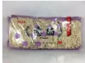
KT054 17.64oz x 20 @東光意麵500G T.D.G DRIED NOODLE- YI STYLE(500G)