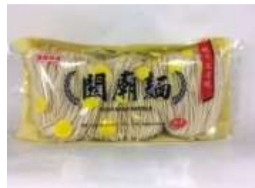
KT051 21.16oz x 20 @東光關廟麵-600G T.D.G DRIED NOODLE- KUAN MIAO STYLE(600G)