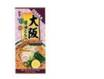
K132 6.2OZ X 12 大阪醬油炸豬排 (12M)