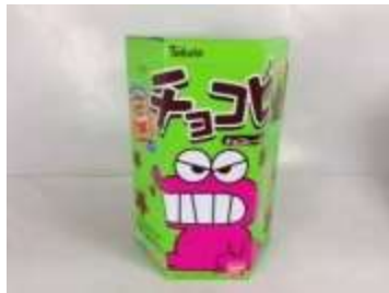
H128 0.88oz x 6 x 8 88531东鸠饼干 - 巧克力(8M) TOHATO BISCUIT- CHOCOLATE (CHOKOBI)