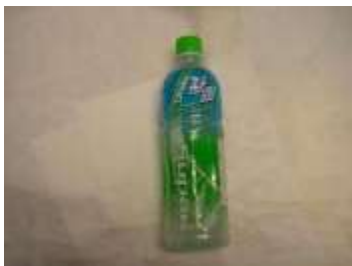
IT106 590ml x 24 舒跑飲料590ML(10M) VITA SUPER SUPAU 590ML