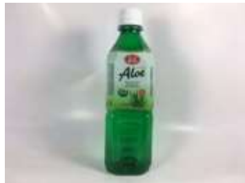
IK032 500ml x 20 韩国蘆薈實 500ml (24M)