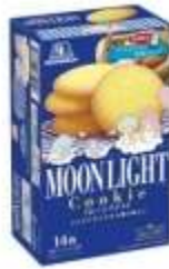
H453 4.0oz x 5 x 8 森永月亮餅乾 (9M)