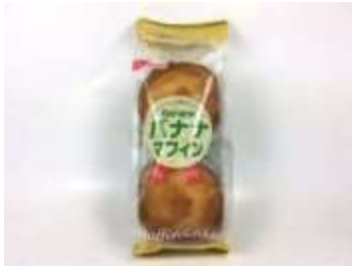
H191 3.88oz x 12 @MARUKIN蛋糕香蕉 2P MARUKIN MUFFIN -BANANA (2P)