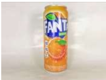
I107 500ml x 24 FANTA 橙子汽水 (12m)