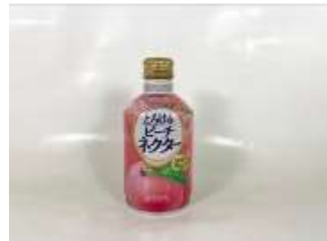
I231 270ML X 24 DYDO桃子果汁13M DYDO PEACH NECTAR