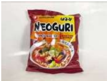
KK023 4.2 oz x 10 101002717 農心韓國香辣海鮮烏冬面(12M) N.S. NEOGURI SPICY SEAFOOD (10PK)