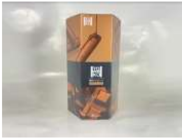
HT123 2.46oz x 40 日式煎捲-巧克力風味(18M) TOKO ROAST COOKIE ROLL- CHOCO FLAVOR