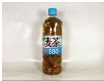
I025 680ml x 24 三多力麥茶(18M)

SUNTORY SOFT DRINK-BARLEY TEA (GREEN DAKARA)