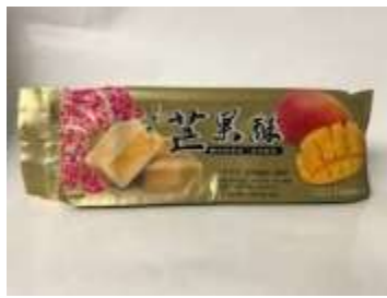
HT108 6.17OZ X 20 @长松條裝台灣好味芒果酥(20入) CHANG SONG MANGO PINEAPPLE COOKIE