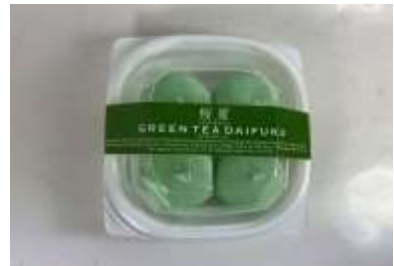
HA017 4.5 oz x 12 x 2 @大福餅-抹茶 (4PCS) *SAKURAYA DAIFUKU - GREEN TEA