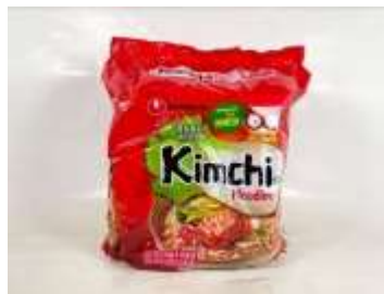
KK016 (4.2OZ X 4) X 4 101002661 農心韓國泡菜湯面(12M) N.S. KIMCHI RAMYUN (16)(4F-PK)