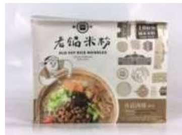
KT027 (2.12oz x 4) x 8 @ 鍋米粉-香菇肉燥 4入老