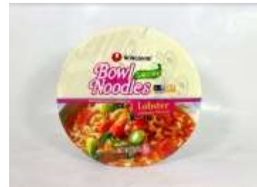
KK039 3.03 oz x 12 101002402農心香辣龍蝦碗麵(10M) N.S. SAVORY BOWL NOODLE LOBSTER SLEE