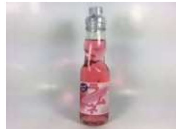
I055 200ML x 30 925 @蜜桃彈珠汽水 FUJI SODA - PEACH (RAMUNE)