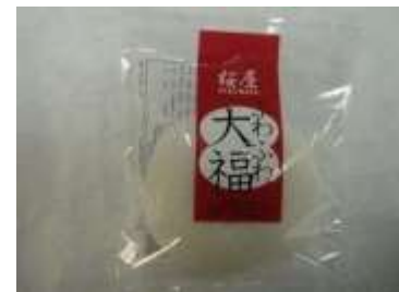
HA008 2.8oz x 20 x 2 @大福餅-白 (單個)