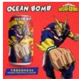
IT023 330 ml x 24 芒果凤梨气泡水(24M) OCEAN BOMB ALL MIGHT MANGO PINEAPPLE FLAVOR