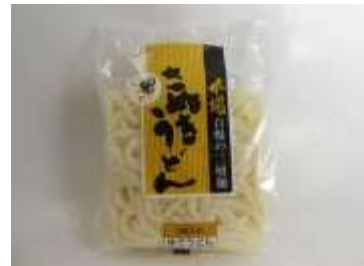
K038 19 OZ X 12 @本場烏冬麵-3 包裝 MIYATAKE SANUKI UDON INSTANT NOODLE (3 PC)