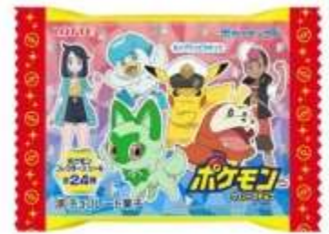
H275 0.81oz x 30 x 8 樂天口袋妖怪威化餅(12M) LOTTE POKEMON WAFER