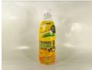
I167 500ml x 24 三矢梳打-蜜糖檸檬(7M) ASAHI MITSUYA CIDER-HONEY LEMON SQUASH 500ML (7M)