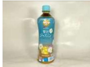
I188 600ml x 24 三得利 伊右衛門 茉莉花茶 (8M) SUNTORY LEMON JASMINE TEA 500ml