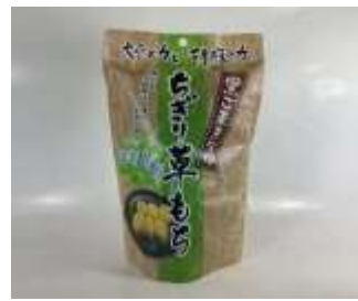
H062 4.58 oz x 12 @精機黑芝麻麻糬 SEIKI MOCHI - BLACK SESAME