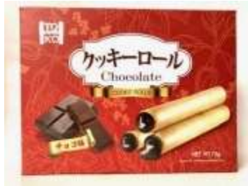
HT111 2.64OZ X 24 黑巧克力甜心爆爆捲(15M) TOKO CHOCOLATE COOKIE ROLLS