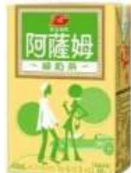
IT041 (400ML x 6) x 4 阿薩姆綠奶茶12M