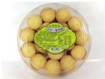
HT061 16.58oz x 12 @友賓小鳳酥 - 綠茶口味 PINEAPPLE COOKIE - GREEN TEA