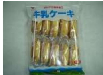
H321 6.3oz x 10 x 2 @幸堂 牛奶蛋糕 SHIAWASEDO- MILK CAKE