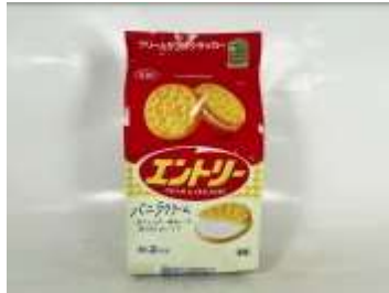
H144 4.64oz x 10 x 2 17452 山崎香草奶油夾心餅乾(11M) YBC ENTRY CRACKER- VANILLA CREAM