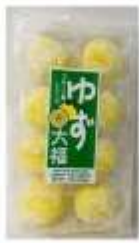
H060 7oz x 12 x 2 @柚子大福餅 KUBOTA BAKED SOFT CAKE - YUZU