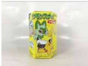
H129 0.81oz x 6 x 8 47064东鸠口袋妖怪 - 布丁口味(8M) TOHATO BISCUIT- PUDDING (POKEMON) FLAVOR