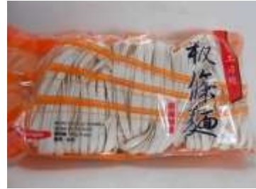
KT013 17.6 oz x 20 @東光板條麵 (九片裝)