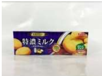
H307 2.3oz x 20 x 2 特濃牛奶餅乾 (12M) FURUTA RICH MILK COOKIE