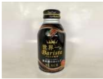
I155 260 ML x 24 DYDO 無糖特調黑咖啡(12M) DYDO BLEND BLACK COFFEE - 260ML