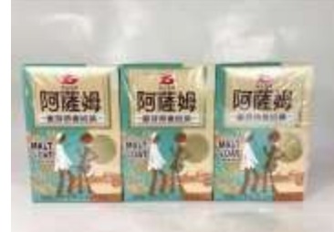
IT051 (400ML X 6) X 4 阿薩姆麥芽&燕麥奶茶(12M)