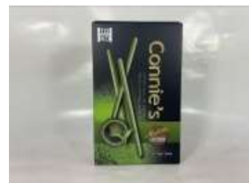
HT119 1.23oz x 24 CONNIE'S 抹茶巧克力味棒 TOKO MATCHA CHOCO STICKS