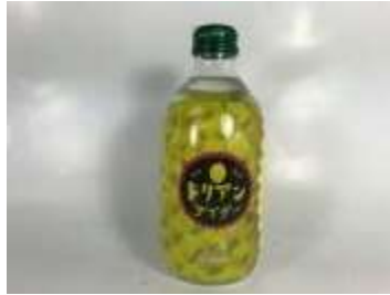
I160 300ML X 24 水果飲料-榴蓮(18M) TOMOMASU DORIAN CIDER 300ML