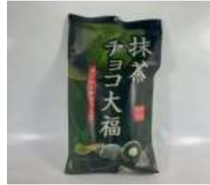
H065 4.58oz x 12 @精機綠茶大福 SEIKI MOCHI - GREEN TEA