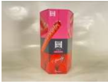
HT124 2.46oz x 40 日式煎捲-草莓巧克力風味(18M) TOKO ROAST COOKIE ROLL- STRAWBERRY CHOCO FLAVOR