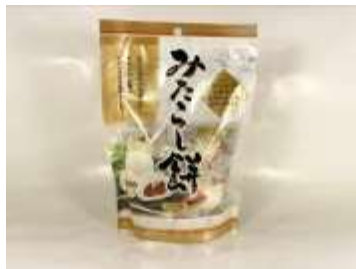
H134 4.2oz x 12 x 2 203169@久保田 红豆棉花糖夹心糯米饼 KUBOTA MOCHI- RED BEAN CAKE (MITARASHI)