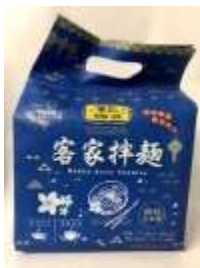
KT017 (4.3OZ X 4) X 6 @寧記客家拌麵