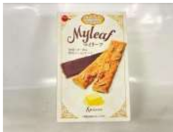
H331 3.4oz x 5 x 6 波本夾心杏仁批 - 牛油風味(8M) ^BOURBON MYLEAF ALMOND PIE - FERMENTED BUTTER