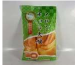
H069 4.58oz x 12 @精機瓜巧克力大福 SEIKI MOCHI - MELON CHOCOLATE