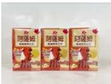
IT053 (400ML X 6) X 4 阿薩姆楓糖腰果奶茶(12M)