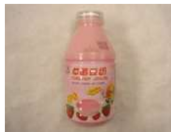
IT027 330ML x 24 正康草莓豆奶(12M)