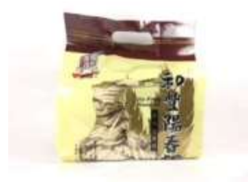
KT045 42.33oz x 12 @和豐陽春麵(中關廟麵)