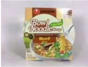
KK018 3.03oz x 12 101002243 農心韓國牛碗麵(12M) N.S. SAVORY BOWL NOODLE BEEF SLEEVE (12PK)