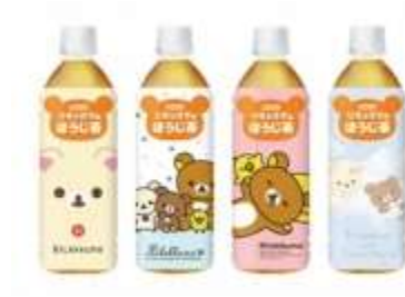
I234 500ML X 24 DYDO 輕鬆熊烘焙茶(10M) DYDO RILAKKUMA HOJICHA