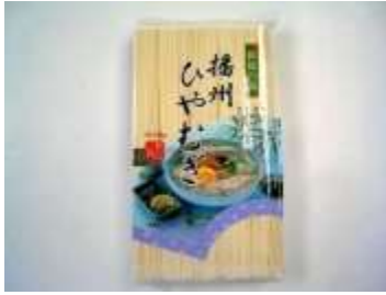
K103 35.27 oz x 9 播州麵線 (24M)

IBONOTAKI DRIED NOODLE M 1kg (BANSYU HIYAMUGI)