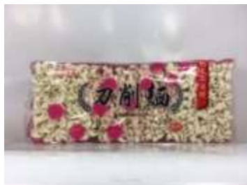
KT055 17.64oz x 20 @東光刀削面-500G T.D.G DRIED NOODLE- SLICE NOODLES (500G)