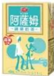
IT044 (400MLx 6) x 4 阿薩姆蘋果奶茶 12M