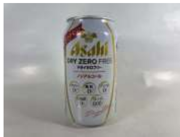
I271 (350ml x 6) x 4 朝日无酒精饮料 ( 12M )