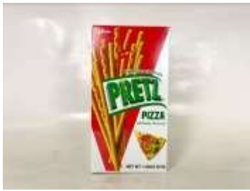
HTI003 1.09 OZ X 10 X 12 GU15304 固力高百力枝 - 披萨棒(12M) GLICO PRETZ BAKED BISCUIT PIZZA