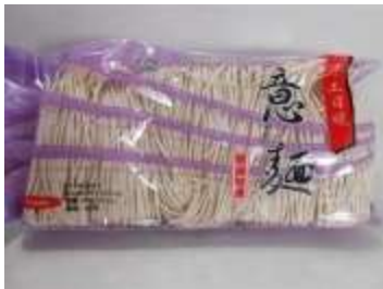
KT014 17.6 oz x 20 @東光意麵 (九片裝)