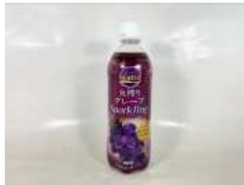
I228 500ML X 24 DYDO葡萄氣水9M DYDO MISTIO GRAPE SPARKLING