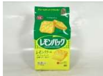
H142 5.24oz x 10 x 2 17450 山崎檸檬奶油夾心餅乾(10M) YBC LEMONPACK CRACKER- LEMON CREAM