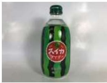
I156 300ML X 24 水果飲料-西瓜(18M) TOMOMASU WATERMELON CIDER 300ML