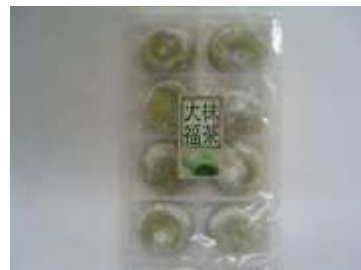
H133 7oz x 12 x 2 @久保田绿茶大福 KUBOTA BAKED SOFT CAKE- GREEN TEA