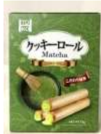
HT112 2.64OZ X 24 抹茶甜心爆爆捲(15M) TOKO MATCHA COOKIE ROLLS