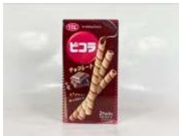
H240 1.72oz x 10 x 4 山崎蛋卷-巧克力(11M) YBC PICOLA BISCUIT -CHOCOLATE