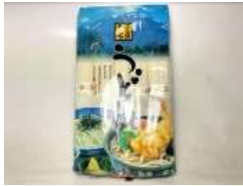
K032 1KG x 12 乐市乌龙面 (24M) AOI DRIED WHEAT NOODLE (KOHBOH UDON)