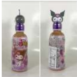
IK049 220ml x 24 5289 三麗鷗黑美飲料(葡萄)(18M) SANRIO KUROMI DRINK (GRAPE)