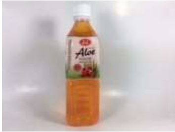
IK042 500ml x 20 韓國蘆薈寶石榴500ml (24M) L&L ALOE DRINK - POMEGRANATE(500ml)