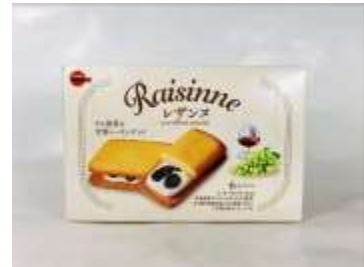
H044 4.4 oz x 5 x 6 波本葡萄乾夾心餅乾 - 黃油風味(9M)

^BOURBON RAISINNE BISCUIT - BUTTER FLAVOR