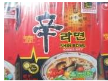
KK031 3.03 oz x 12 101002101農心辛拉麵碗麵(12M) N.S. SHIN BOWL SLEEVE NOODLE (12PK)