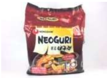
KK014 (4.83oz x 4) x 8 101003679 農心小浣熊辣海鮮炒面(10M) N.S. STIR-FRY NEOGURI- SPICY SEAFOOD(32)(4F-PK)