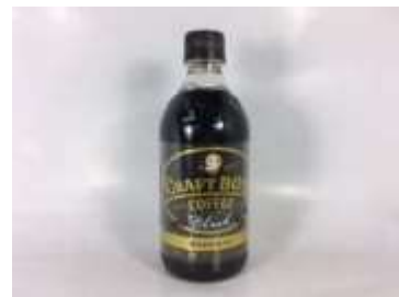
I088 500ML X 24 三多力工藝黑咖啡(12M)