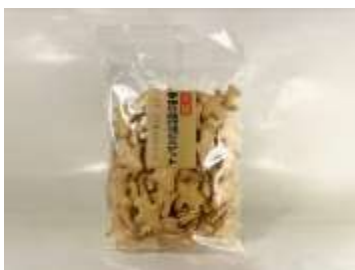
HT134 4.23oz x 24 @台湾名物飞机状饼干 TOKO AIRPLANE SHAPE BISCUIT