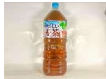
I026 2L x 6 三多力麥茶 2L (18M)

SUNTORY SOFT DRINK- BARLEY TEA (GREEN DAKARA) 2L