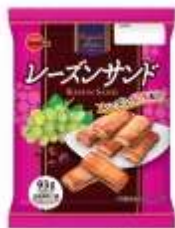
H373 3.1oz x 12 x 2 波本葡萄夾心餅乾(10M) BOURBON COOKIES-RAISIN SAND