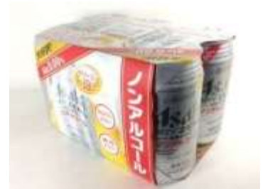
I008 (350ml x 6) x 4 朝日無酒精啤酒(12M) ASAHI DRY ZERO SOFT DRINK 350ml