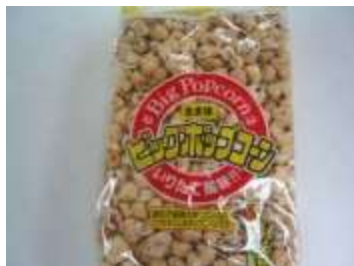
H047 5.8 oz x 15 x 2 @爆玉米花