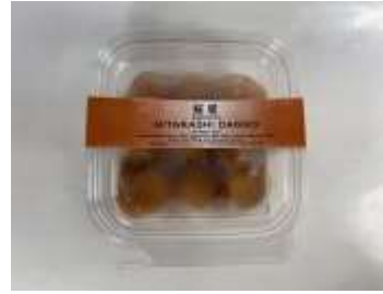
HA014 4.5 oz x 12 x 2 @桜屋御手洗団子(9pcs) *SAKURAYA MITARASHI DANGO