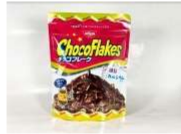
H261 2.46 oz x 12 12253 日新 CISCO巧克力薄片小餅乾(10M) ^NISSIN CISCO'S BAKED CHOCO. CORN FLAKE-REGULAR