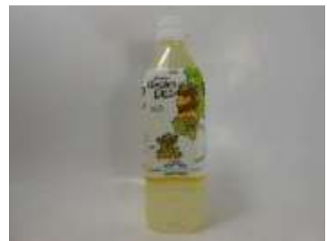
I257 470ml x 24 蜂蜜檸檬汁 470ML(7M)