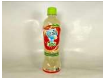
I122 425ML x 24 可樂Q系列蘋果汁 (小) (8M)