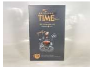
IK027 (0.7 fl oz x 10 )x40 JELLY B 濃縮咖啡棒(24M)

JELLY B ESPRESSO TIME PLUS+ COFFEE STICK