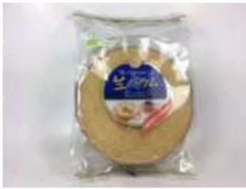
H184 10oz x 9 @千層捲蛋糕 MARUKIN BAKED CAKE - ROLL CAKE(NAMA BAUMKUCHEN)