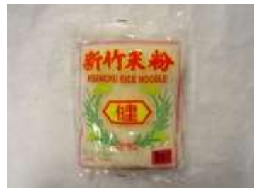
KT076 10.58 oz x 40 @台灣祥益新竹米粉 X.Y. HSINCHU RICE NOODLE