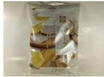
H186 8.2 OZ x 9 @千層蛋糕-起司口味 MARUKIN BAUM CAKE - CHEESE FLAVOR