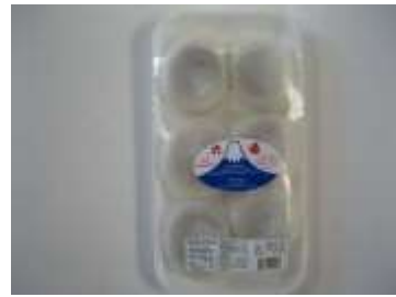
HA011 10 oz x 20 @大福餅-白 *SAKURAYA DAIFUKU WHITE RICE CAKE