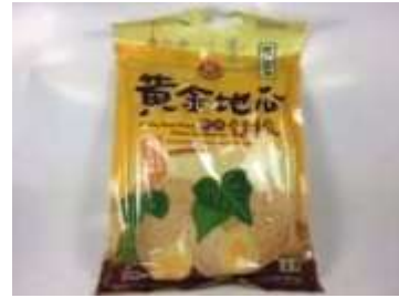
KT090 21.16 oz x 12 @新宏地瓜麵線