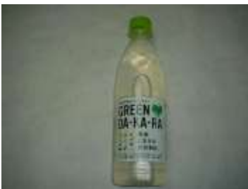
I251 600ml x 24 SUNTORY運動飲料水 (11M) SUNTORY SOFT DRINK - (GREEN DAKARA)