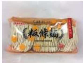
KT053 21.16oz x 20 @東光板條面-600G T.D.G DRIED NOODLE- BANG TIAO STYLE 600G)