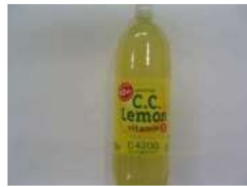
I063 1.5 L x 8 三多力柠檬(大) (6M) SUNTORY SOFT DRINK-C.C.LEMON (L)