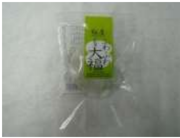
HA009 2.8oz x 20 x 2 @大福餅-綠 (單個) *SAKURAYA FUWA FUWA GREEN