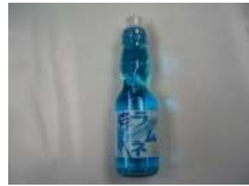
I048 200ML x 30 802 @藍色夏威夷彈珠汽水 FUJI SODA - BLUE HAWAII (RAMUNE)