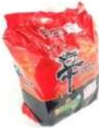
KK032 (4.23oz x 4 )x4 101004224農心辛拉麵包裝 (12M) N.S. SHIN RAMYUN(16)(4x4)