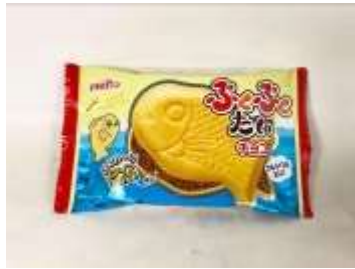
H122 0.58oz X 10 X 12 Meito 巧克力鯉 ( 12M ) ^PUKUPUKU TAI - CHOCO(YELLOW)