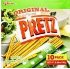
HTI015 (6.35oz x 5) x 8 GU15309 固力高百力枝-沙拉 (聚会包)(12M) GLICO PRETZ PARTY PK- ORIGINAL (SALAD)