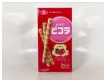
H241 1.72oz x 10 x 4 山崎蛋卷-草莓 (11M) YBC PICOLA BISCUIT-STRAWBERRY