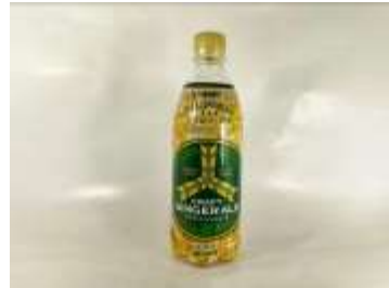
I169 500ml x 24 三矢梳打-薑啤(7M) ASAHI MITSUYA CIDER-GINGER ALE 500ML (7M)