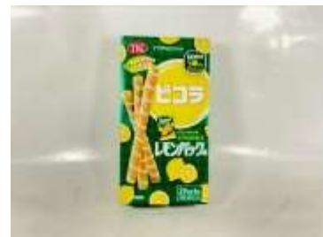
H239 2 oz X 10 X 4 山崎蛋卷- 檸檬風味(10M) YBC PICOLA BISCUIT- LEMON PACK