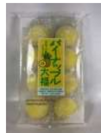
H054 7oz x 12 x 2 @鳳梨大福餅

KUBOTA BAKED SOFT CAKE - PINEAPPLE FLAVOR