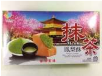
HT053 6.34oz x 20 @友賓綠茶鳳梨酥盒裝 PINEAPPLE COOKIE - GREEN TEA (BOX PACKED)