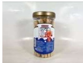
HT063 7.05 oz x 12 @(長松)松屋鮮奶棒(奶蛋素) CHANG SONG MATSUYA BISCUIT-MILK FLAVOR