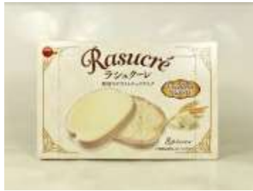
H104 3.8oz x 5 x 6 波本餅乾-法式香草脆餅(8M) ^BOURBON BISCUIT- RASUCRE VANILLA