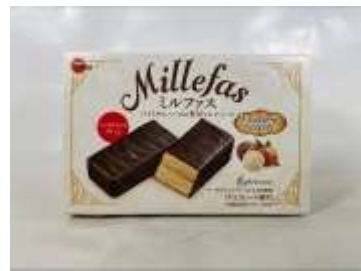
H102 3.7oz x 5 x 6 波本餅乾-法式巧克力餅乾(8M) ^BOURBON BISCUIT- MILLEFAS CHOCOLATE