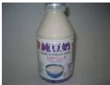
IT025 330 ML x 24 正康纯豆奶(12M)