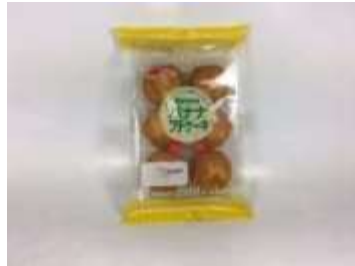
H193 3.1oz x 12 @MARUKIN迷你蛋糕-香蕉 6P MARUKIN BAKED MUFFIN- BANANA MINI (6P)