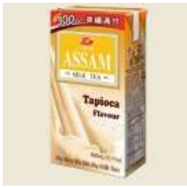
IT057 (300MLX 6) X 4 阿薩姆奶茶 – 珍珠奶茶口味300ML (12M) ASSAM MILK TEA - TAPIOCA FLAVOR 300ML