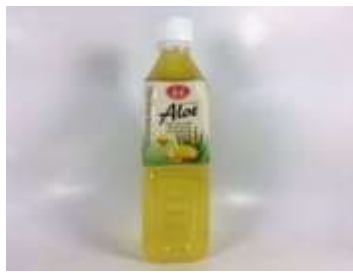
IK040 500ml X 20 韓國蘆薈寶芒果500ml (24M) L&L ALOE DRINK - MANGO(500ml)