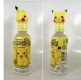
IK047 220ml x 24 5517 神奇寶貝皮卡丘飲料 (芒果) (18M) POKEMON PIKACHU DRINK (MANGO)