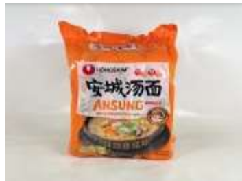
KK038 (4.4oz x 4) x 4 101002668農心韓國安城湯麵(12M) N.S. AN SUNG TANG MYUN (16)(4F-PK)