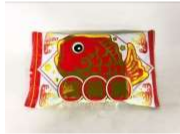
H123 0.58oz X 10 X 12 Meito 福福鯉(12M) ^FUKUFUKU TAI - CHOCOLATE(RED)