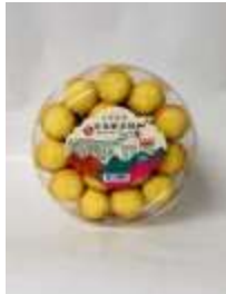
HT054 16.58OZ X 12 @友賓小鳳梨酥-珍珠奶茶口味 PINEAPPLE COOKIE - MILK TEA