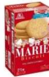
H451 4oz x 5 x 8 03660 森永一口餅乾 (9M)