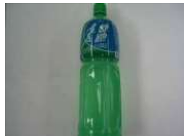
IT113 1.5L x 12 舒跑飲料 (10M) VITA SUPER SUPAU 1.5L