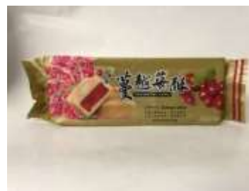
HT107 6.17OZ X 20 @长松條裝台灣好味蔓越莓酥(20入) CHANG SONG CRANBERRY PINEAPPLE COOKIE