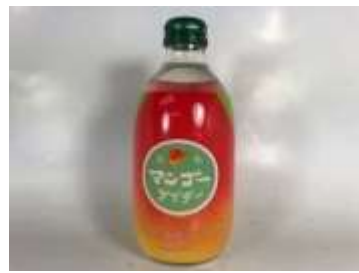
I157 300ML X 24 水果飲料-芒果(18M) TOMOMASU MANGO CIDER