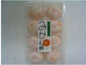
H019 7oz x 12 x 2 @橘子大福饼