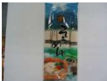
K077 14.1 oz x 20 乐市寿面 (24M) AOI DRIED WHEAT NOODLE-(S) (KOHBOH SOMEN)