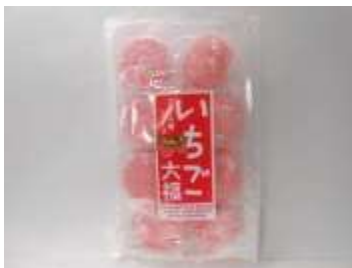
H012 7oz x 12 x 2 @草莓大福饼

KUBOTA BAKED SOFT CAKE - STRAWBERRY FLAVOR