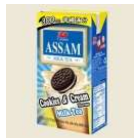
IT056 (300MLX 6) X 4 阿薩姆奶茶 - 黑白配 300mL (12M)

ASSAM MILK TEA - COOKIES & CREAM FLAVOUR 300ML