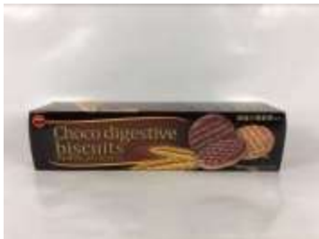
H083 3.4oz x 12 x 4 波本巧克力餅干 (12M) ^BOURBON DIGESTIVE BISCUIT- CHOCOLATE