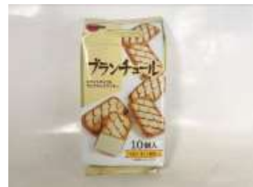
H338 2.7oz x 10 x 2 35282 波本餅乾 (12M) ^BOURBON COOKIE (BLANCHULE)