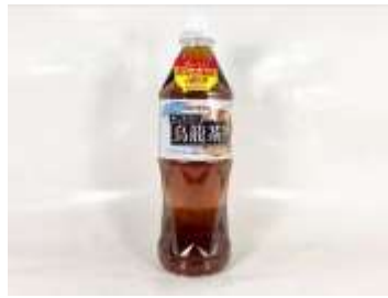
I046 525ml x 24 三多力烏龍茶500ML (12M) SUNTORY SOFT DRINK-OOLONG TEA (S)