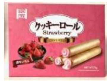
HT110 2.64OZ X 24 草莓甜心爆爆捲 (15M) TOKO STRAWBERRY COOKIE ROLLS