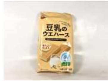
H018 3.9 oz x 6 x 2 35341 豆乳威化餅 (10M)