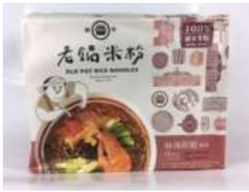
KT028 (2.12oz x 4) x 6 @老锅米粉-麻辣鲜虾 4入

LAO GUO RICE NOODLE-SPICY SHRIMP FLAVOR 4P