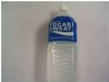
I052 2L x 6 大家運動飲料 (大)(12M) OTSUKA SOFT DRINK (POCARI SWEAT) (L)