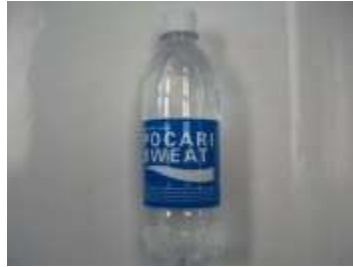
I050 500ML x 24 大家運動飲料 (小)(12M) OTSUKA SOFT DRINK (POCARI SWEAT) (S)