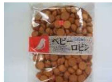
H059 4.9 oz x 24 @一口碎饼(小)