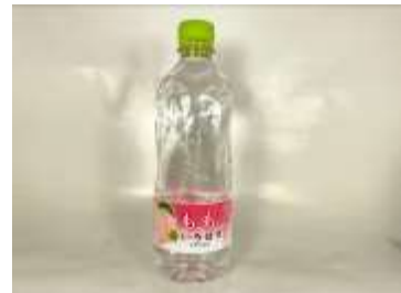
I103 540ml x 24 可口可樂桃子水(12M)