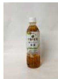
I154 500ml x 24 麒麟下午茶-无糖500ML(9M)

KIRIN SOFT DRINK - AFTERNOON TEA SUGAR FREE 500ml