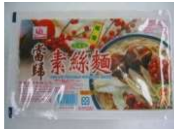
KT003 10.5 oz x 12 @福慧當歸素絲麵 VEGETARIAN INSTANT FINE NOODLE (DANG GUEI) 5P