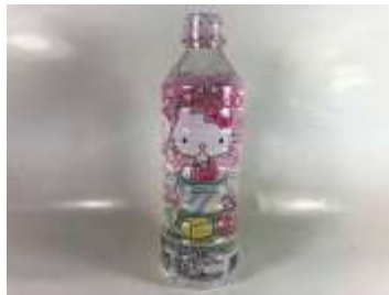
I135 500 ml x 24 波本离子水500ml (24M)