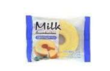
H270 2.8OZ X 30 @迷你千層蛋糕 - 牛奶 MINI BAUMKUCHEN - MILK FLAVOR