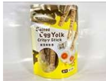
HT070 4.23oz x 12 @长松咸蛋黃酥棒 CHANG SONG SALTY EGG YOLK CRISPY STICK