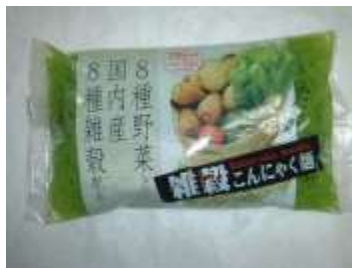
K015 7 oz x 10 山藥麵條-菠菜 (10M)

ISHIBASHIYA YAM NOODLE SPINACH (KONNYAKU NOODLE)