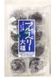
H008 7oz x 12 x 2 @蓝莓大福饼

KUBOTA BAKED SOFT CAKE - BLUEBERRY FLAVOR