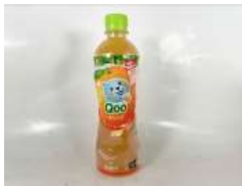
I120 425ML x 24 可樂Q系列橘子汁 (小) (8M)