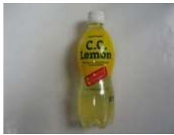
I062 500ML x 24 三多力柠檬(小) (6M) SUNTORY SOFT DRINK-C.C.LEMON (S)