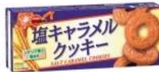
H049 2.8oz x 12 X 4 波本餅乾-鹽焦糖口味(12M)