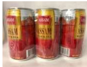
IT036 (340ml x24) 阿薩姆紅茶 (罐裝) (24M)