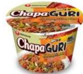
KK049 4.02oz x 6 101004133 農心炸醬面(12M) N.S. CHAPAGURI (6PK) BIG BOWL