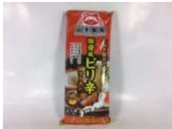
K067 7.76oz x 20 山本拉麵2人入-辛辣豚骨(12M) YAMAMOTO RAMEN BAG 2P-SPICY PORK FLAVOR