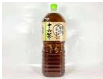
I079 2L x 6 朝日十六茶(大) (12M) ASAHI SOFT DRINK-TEA 16 GRAIN MIX (JYUROKU) (L)