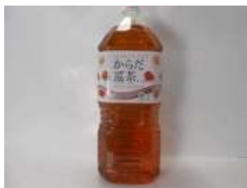
I140 2L X 6 可樂巡茶 2L (8M)

COCA COLA SOFT DRINK-GREEN TEA 2L(KARADA MEGURI)