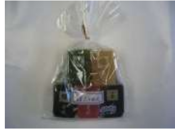
J012 12.7 oz x 12 @丸一 羊羹(综合)