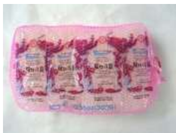
KT079 10.5 oz x 50 @信全龍口粉絲 - 網裝 LUNGKOW BEAN THREAD