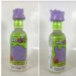
IK048 220ml x 24 5531 口袋妖怪百变怪飲料 (蘋果)(18M) POKEMON METAMONG DRINK (APPLE)