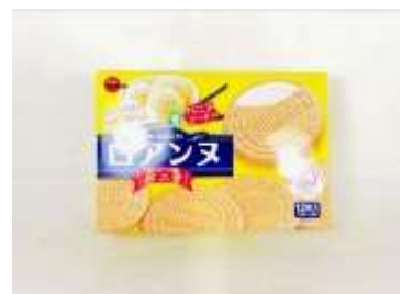
H098 2.9ozx 6 x 6 波本威化-香草 (10M) BOURBON WAFER - VANILLA (ROANNE)