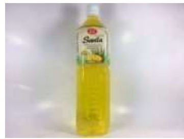
IK041 1.5 L x 12 韓國蘆薈寶芒果1.5L(24M) L&L ALOE DRINK - MANGO(1.5L)