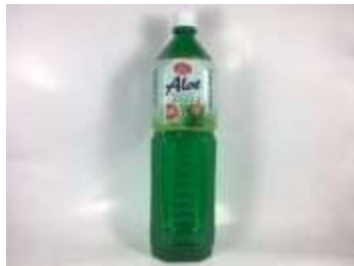
IK031 1.5L x 12 韩国蘆薈實無糖 1.5L (24M)