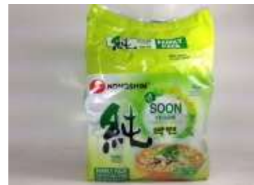
KK011 (3.95oz x 4) x 8 101002640農心韩国蔬菜湯面 (12M)