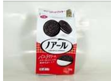
H149 5.86oz x 10 x 2 12708 山崎黑巧克力夾心餅乾(10M) YBC NOIR BISCUIT -BLACK COCOA (10M)