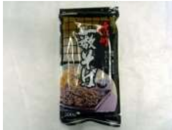
K004 15.8oz x 24 蕎麥麵 (YABU SOBA) (12M)

TOKAKUSHI DRIED BUCKWHEAT NOODLE (YABU SOBA)