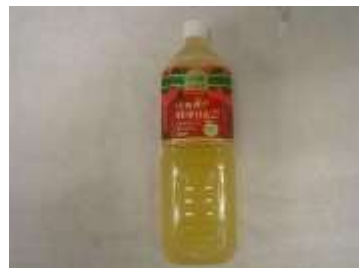
I176 1.5L x 8 麒麟青蘋果汁1.5L (9M) KIRIN KOIWA I APPLE