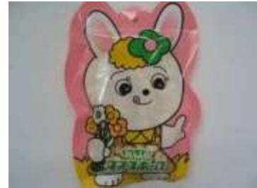
H024 1.7oz x 20 @卡通营养小饅頭(小白兔) IWAMOTO JUNIOR BABY BISCUIT (BUNNY) BORO