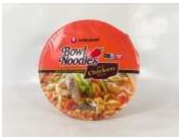
KK029 3.03 oz x 12 101002100農心辣味鸡碗面(12M) N.S. BOWL NOODLE SPICY CHICKEN SLEEVE (12PK)