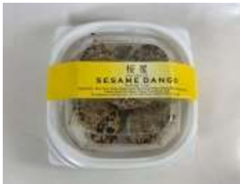
HA015 3.5 oz x 12 x 2 桜屋芝麻団子(5pcs) *SAKURAYA SESAME DANGO