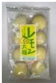
H131 7oz x 12 x 2 @柠檬大福饼 KUBOTA BAKED SOFT CAKE - LEMON FLAVOR