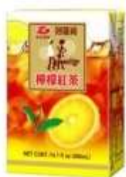
IT040 (400ML x 6) x 4 阿薩姆檸檬紅茶12M