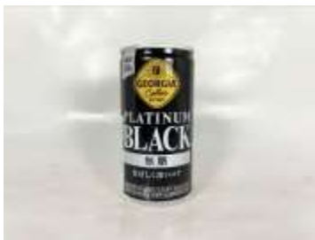
I081 185ML x 30 可樂喬治亞咖啡 (10M)

COCA COLA SOFT DRINK-GEORGIA PLATINUM BLACK