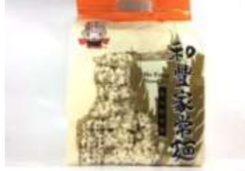
KT047 42.33oz x 12 @和豐家常麵(刀削麵)