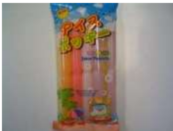
IT003 2.99oz x 10 pc x 12 @正佳珍乳酸冰棒 - 綜合 C.C.C. JUICE POPSICLE - MIX