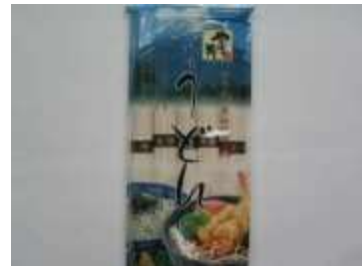
K076 14.1 oz x 20 乐市乌龙 (24M) AOI DRIED WHEAT NOODLE-(S) (KOHBOH UDON)