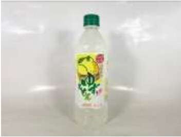
I232 500ML X 24 DYDO柚子檸檬果汁10M DYDO YUZU LEMON