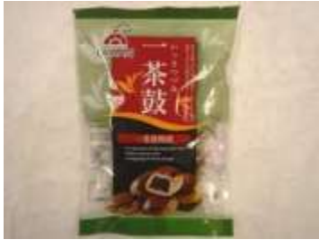
H077 5.2oz x 12 @一茶鼓饅頭 LAMAN SWEET BEANS CAKE (ISSATSUZUMI MANJYU 10P)