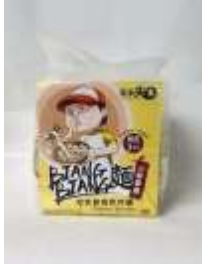
KT091 (3.63oz x 4) x 12 柴米夫妻地表最寬乾拌麵(川椒麻醬) (12M)

ZHENLI BIANG BIANG NOODLES - PEPPER TAHINI