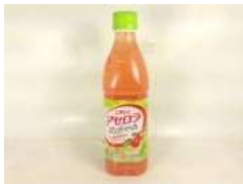
I197 430 ml x 24 三多力-新鮮櫻桃口味 (6M) SUNTORY SOFT DRINK - ACEROLA REFRESH