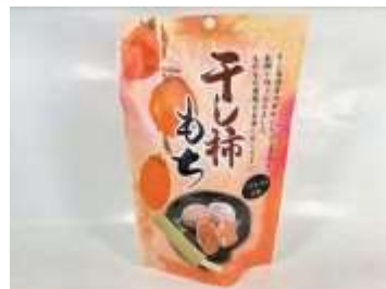
H071 4.58oz x 12 @精機柿子干口味大福 SEIKI MOCHI - DRIED PERSIMMON FLAVOR