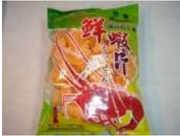
HT049 5.29oz x 10 @穎成鮮蝦片-芥末 Y.C. SHRIMP FLAVORED CRACKER-WASABI