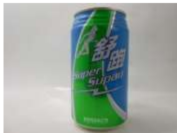
IT111 335 ml x 24 舒跑飲料 (15M) VITA SUPER SUPAU 335ml