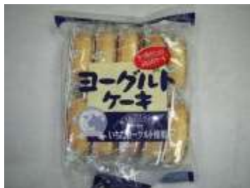
H322 5.9 oz x 10 x 2 @幸堂 乳酪小蛋糕 SHIAWASEDO- YOGURT CAKE