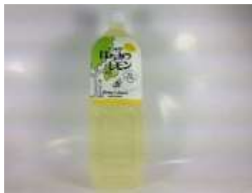
I258 1.5L x 8 蜂蜜檸檬汁 1.5L(8M)