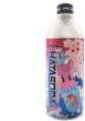
I064 483ml x 24 HATA飲料 - 葡萄汽水(鋁瓶) (12M) HATA SODA- GRAPE RAMUNE (BOTTLE)