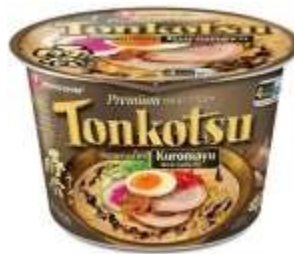
KK048 3.56oz x 6 101004173 農心黑蒜豬骨濃湯面(10M) N.S. TONKOTSU (6PK) BLACK GARLIC BIG BOWL