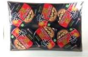
KK034 2.65oz x 6 101003370農心黑色辛杯麵 (12M) N.S. SHIN BLACK CUP (6PK)