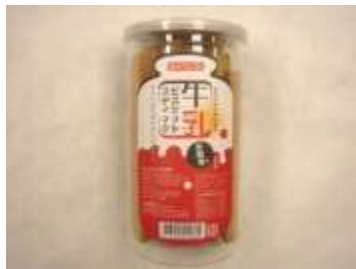
HT064 8.10 oz x 12 @長松松屋芝麻棒(奶蛋素) CHANG SONG MATSUYA BISCUIT- SESAME FLAVOR