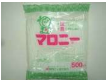
K011 17.64 oz x 20 @日本冬粉