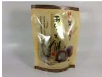
H135 4.2oz x 12 x 2 203121@久保田 红豆衣糯米饼 KUBOTA MOCHI- OUTSIDE RED BEAN CAKE(ANKORO)