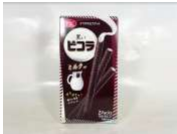
H155 1.72oz x 10 x 4 山崎巧克力蛋卷-香草(10M) YBC BLACK PICOLA BISCUIT