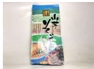
K080 1.76LB x 12 乐市荞麦面(12M) AOI DRIED BUCKWHEAT NOODLE(FURUSATOYAMAIMO SOBA)