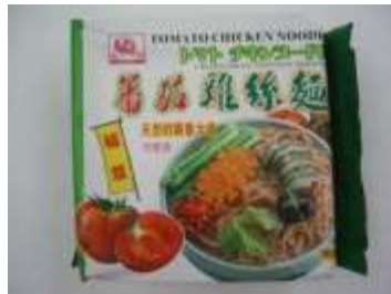
KT002 5.2 oz x 12 @福慧番茄雞絲麵 VEGETARIAN INSTANT NOODLE (TOMATO) 2P