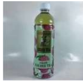
IT062 (580ML X 24) 阿薩姆荔枝紅茶(12M) ASSAM LYCHEE TEA