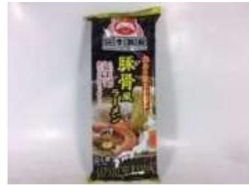
K066 7.76oz x 20 山本拉麵2人入-豚骨(12M) YAMAMOTO RAMEN BAG 2P- PORK FLAVOR