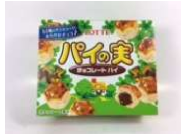
H067 2.5oz x 10 x 6 樂天果夾型巧克力派(12M) LOTTE BISCUIT- CHOCOLATE (S) PAI NO MI