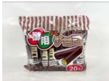
HT115 7.76oz x 12 玉米棒-巧克力口味(14M) TOKO CORN PUFF- CHOCOLATE