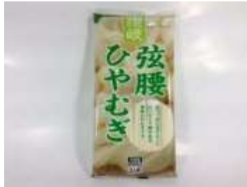
K123 21.1oz x 20 讃岐冷麦面 (18M)

SANUKI SHISEI DRIED NOODLE (TSURUKOSHI HIYAMUGI)