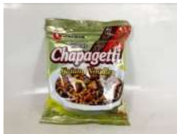
KK027 4.48OZ X 10 101002716 農心雜醬麵(12M) N.S. CHAPAGETTI (10PK)