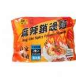
KT018 18.13OZ x 20 @寧記麻辣銷魂麵