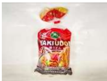
K048 23.59oz x 12 铁板酱油乌冬麵(12M) ITSUKI ANIMAL FREE YAKI UDON NOODLE 3P (SAUCE)