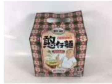
KT030 (3.88oz x4) x 12 @憨仔面-葱剁椒麻味