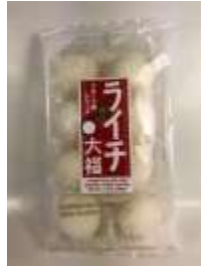
H007 7oz x 12 x 2 @荔枝大福饼