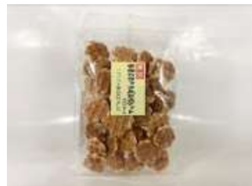
HT133 3.52oz x 24 @台湾名物鸡蛋松煎饼蜂蜜口味 TOKO EGG WAFFLE HONEY FLAVOR