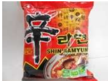
KK024 4.2 oz x 10 101002715 農心辛拉麵(12M) N.S. SHIN RAMYUN (10PK)