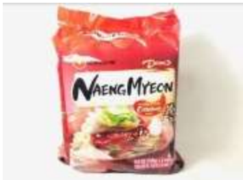
KK035 (5.6oz x 3) x 6 101005282農心韩国冷面辣味 (10M) N.S. DONGJI COLD NOODLE BIBIM(18 PK)