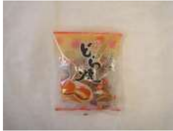
H079 5.6oz x 12 @天恵銅鑼燒 TENKEI PASTRY - SWEET BEANS (DORAYAKI)