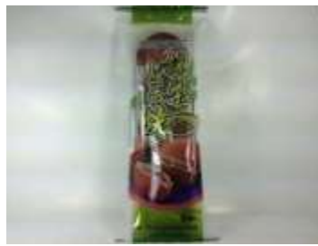
H004 10.5oz x 12 @蛋糕-绿茶

HIYOSHI PASTRY - GREEN TEA (MATCHA DORAYAKI)