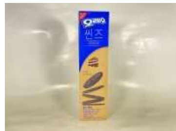
HK025 2.96oz x 24 奧利奧薄片 (提拉米蘇) (12M) NABISCO OREO THINS (TIRAMISU)