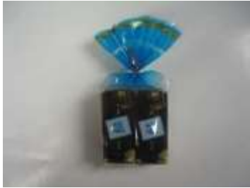
J005 12.5 oz x 12 x 2 @羊羹 (卤味)