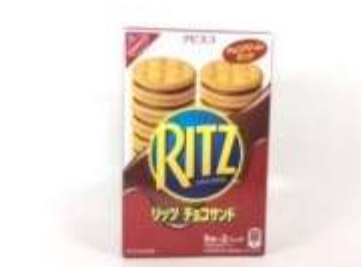
H183 5.64oz x 10 4274954 巧克力夾心餅乾(13M) NABISCO RITZ BISCUIT- CHOCOLATE