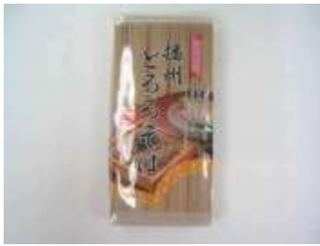
K100 28.21oz x 9 播州蕎麥面 (18M)

IBONOTAKI DRIED BUCKWHEAT NOODLE 800g(TORORO SOBA)