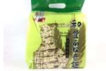
KT048 42.33oz x 12 @和豐南投意麵