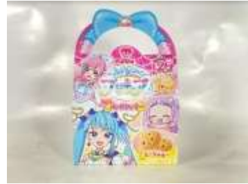
H302 0.52oz x 10 光之美少女版袋裝餅干(12M) FURUTA PRECURE BAG COOKIE