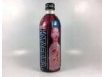
I065 483ml x 24 HATA飲料 - 桃汽水(鋁瓶) (12M) HATA SODA- PEACH RAMUNE (BOTTLE)