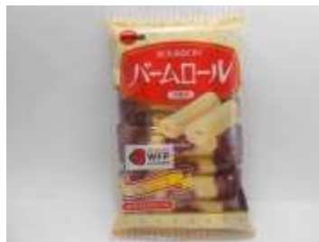
H028 3.2 oz x 12 x 2 35418 波本奶油蛋糕(8M) ^BOURBON ROLL CAKE-VANILLA (BAUM ROLL)