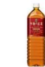
I074 1.5L x 8 麒麟午後紅茶(原味)(12M) KIRIN SOFT DRINK-AFTERNOON TEA- STRAIGHT (L)