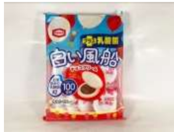
H265 2.32oz x 12 龟田白色气巧克力奶油 (5M) KAMEDA SHIROI FUSEN CHOCOLATE CREAM