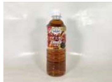
I224 525ML X 24 DYDO冰凍紅茶10M DYDO EXTRA RICH TEA ICED TEA