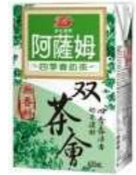
IT048 (400ML x 6) x 4 阿薩姆奶茶-四季春双茶会 (12M)