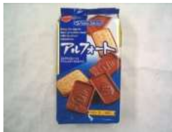
H337 3.5oz x 10 x 2 35283 波本城堡餅乾(巧克力) (12M) ^BOURBON BAKED WHEAT BISCUIT (ALFORT)