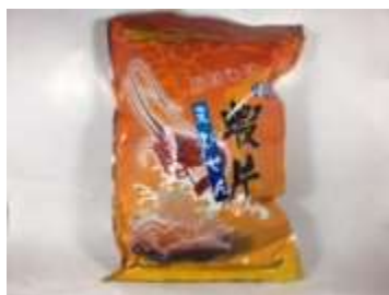
HT100 5.29oz x 10 @穎成鮮蝦片(鋁袋) TDG SHRIMP FLAVORED CRACKER- PREMIUM