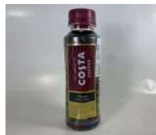
I080 265ml x 24 咖世家咖啡(10M) COSTA COFFEE 270ml