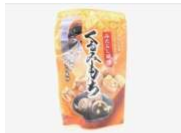
H072 3.88oz x 12 @精機核桃口味大福 SEIKI MOCHI - WALNUT FLAVOR