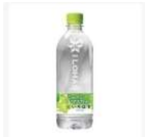
I134 540ML x 24 可口可樂青葡萄水540ML (8M)

COCA COLA ILOHAS WATER MUSCAT FLAVOR 540ML