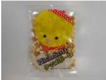
H022 2.6 oz x 30 @營養小饅頭 (HADSON BRAND) IWAMOTO EGG BORO