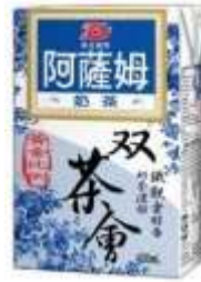
IT047 (400ML x 6) x 4 阿薩姆奶茶-双茶会 (12M)