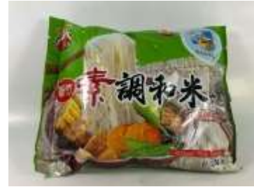
KT034 2.11OZ X 30 新竹調和沖泡米粉 - 素 (12M)