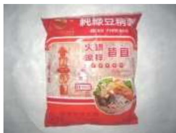
KT080 10.5oz x 50 @合歡牌寬條粉絲 BEAN THREADS