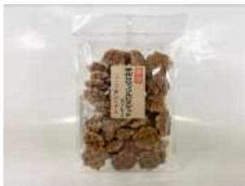
HT132 3.52oz x 24 @台湾名物鸡蛋松煎饼咖啡口味 TOKO EGG WAFFLE COFFEE FLAVOR