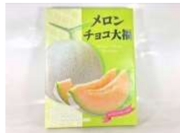
H075 13.75oz x 16 @精機瓜巧克力大福 SEIKI MOCHI- MELON CHOCOLATE DAIFUKU