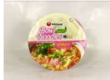
KK001 3.03oz x 12 101002188農心韩国蝦碗面 (12M)

N.S. SAVORY BOWL SHRIMP NON-SPICY SLEEVE (12PK)