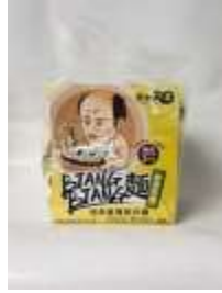
KT093 (3.45oz x 4) x 12 柴米夫妻-地表最寬乾拌麵(醇濃炸醬)(12M)

ZHENLI BIANG BIANG NOODLES - FRIED SAUCE