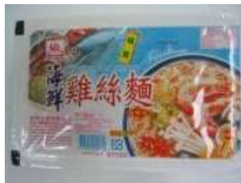
KT005 10.5 oz x 12 @福慧海鮮雞絲麵 VEGETARIAN INSTANT FINE NOODLE (SEAFOOD) 5P