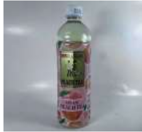
IT064 (580ML X 24) 阿薩姆桃子茶(12M) ASSAM PEACH TEA