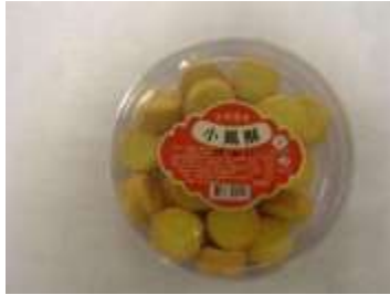
HT051 16.58oz x 12 @友賓圓型小鳳梨