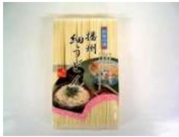
K101 35.27 oz x 9 播州烏冬面 (18M)

IBONOTAKI DRIED NOODLE L 1kg (BANSYU HOSO UDON)