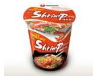
KK043 2.3oz x 6 101002407農心辣蝦杯麵(12M) N.S. SPICY SHRIMP FLAVORED CUP (6PK)