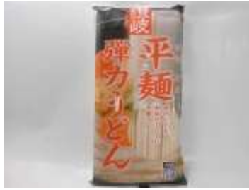
K120 21.1 OZ x 20 讃岐平麵 (彈力) (12M)

SANUKI SHISEI DRIED NOODLE (HIRAMEN DANRIKI UDON)