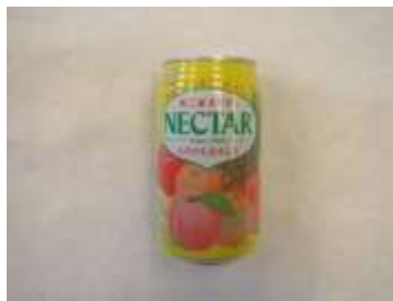
I117 350 ML x 24 富士屋果子飲料 (綜合) (12M)