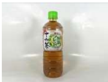
I078 600ML x 24 朝日十六茶 600 ml (12M) ASAHI SOFT DRINK-16 GRAIN MIX TEA(JYUROKU CHA)600M