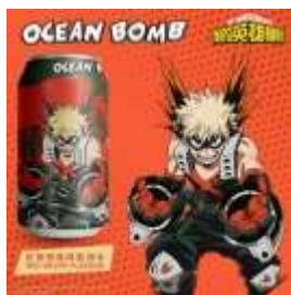
IT024 330 ml x 24 红葡萄风味气泡水(24M)