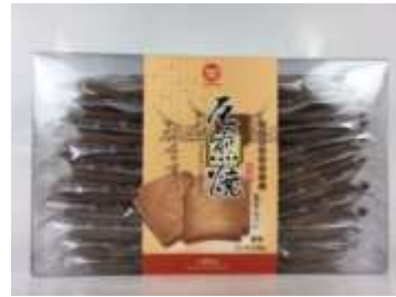
HT003 8.11oz X 12 @瓦煎燒透明盒-原味 YEOU BIN CRACKER - ORIGINAL FLAVOR