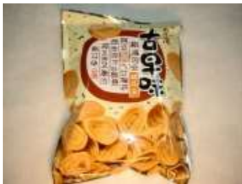
HT067 5.64oz x 15 @小老板豬耳朵 XIAO LAO BAN EAR BISCUITS