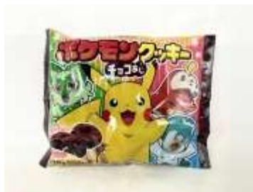
H100 4.44oz x 16 x 2 神奇宝贝巧克力饼干 (10M) FURUTA POKEMON COOKIE CHOCOLATE