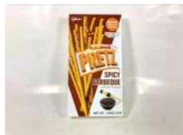
HTI002 1.09oz x 10 x 12 固力高百力枝-辣bbq味棒(12M) GLICO PRETZ BAKED BISCUIT SPICY BARBEQUE