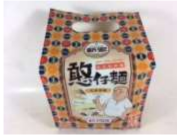
KT032 (3.88oz x4) x 12 @憨仔面-芝麻香椿味