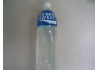
I051 1.5L x 8 大家運動飲料 (中)(12M) OTSUKA SOFT DRINK (POCARI SWEAT) (M)