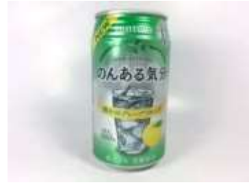
I186 350ml x 24 三多力无酒精饮料 - 柚子 (12M) SUNTORY SOFT DRINK-GRAPEFRUIT FLAVOR