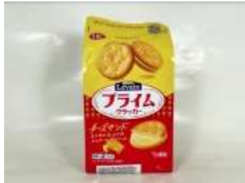
H143 4.57oz x 10 x 2 15508 山崎芝士奶油夾心餅乾(10M) YBC LEVAIN PRIME CRACKER- CHEESE CREAM