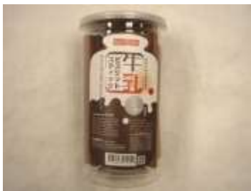
HT062 7.10 oz x 12 @長松松屋可可棒(奶蛋素) CHANG SONG MATSUYA BISCUIT- COCOA FLAVOR