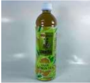
IT063 (580ML X 24) 阿薩姆檸檬紅茶(12M) ASSAM LEMON TEA