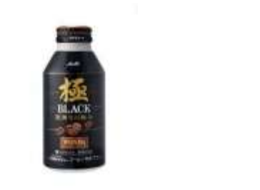
I244 400ml x 24 朝日黑豆咖啡(12M) ASAHI WONDA BLACK KIWAMI COFFEE 400ML