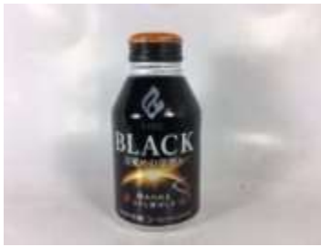
I041 275ml x 24 麒麟火黑咖啡 (12M) KIRIN FIRE BLACK COFFEE 275ml