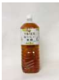
I153 2L x 6 麒麟下午茶-无糖2L (9M)

KIRIN SOFT DRINK - AFTERNOON TEA SUGAR FREE 2L