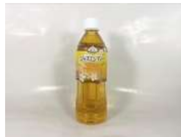
I223 500ML X 24 DYDO茉莉花茶9M DYDO EXTRA RICH TEA JASMINE TEA 500ML