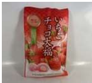
H074 4.58oz x 12 @精機草莓大福 SEIKI MOCHI - STRAWBERRY