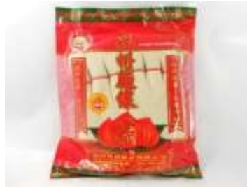
KT089 26.45oz x 10 @新宏福州麵線