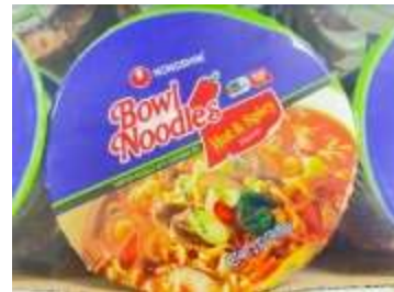
KK025 3.03 oz x 12 101002098 農心特辣碗麵 (12M) N.S. BOWL NOODLE HOT & SPICY SLEEVE (12PK)