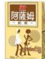
IT042 (400ML x 6) x 4 阿薩姆奶茶 12M