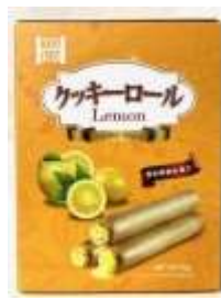
HT109 2.64OZ X 24 檸檬甜心爆爆捲 (15M) TOKO LEMON COOKIE ROLLS