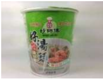
KT007 1.41 oz x 12 @妙師傅-海鮮雞絲杯麵