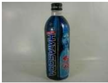
I061 483ml x 24 HATA飲料 - 原味汽水(鋁瓶) (12M) HATA SODA- RAMUNE (BOTTLE)