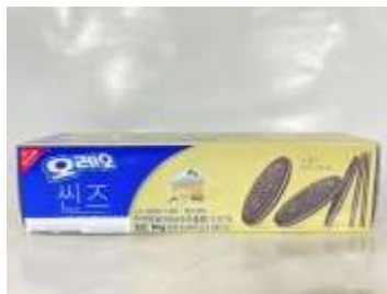
HK024 2.96oz x 24 奧利奧薄片 (香草慕斯) (12M) NABISCO OREO THINS (VANILLA MOUSSE)