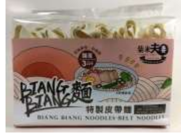
KT094 14.81oz x 12 柴米夫妻特制皮帶麵(12M)