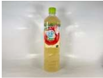
I123 950ml x 12 可樂Q系列蘋果汁 (大) (10M)