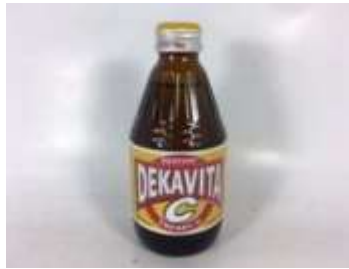
I029 (210MLX 6) X 4 三多力VC飲料(12M)