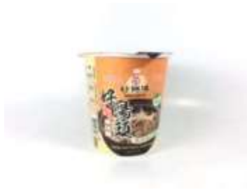
KT008 1.41 oz x 12 @妙師傅-藥膳素絲面 (12M)