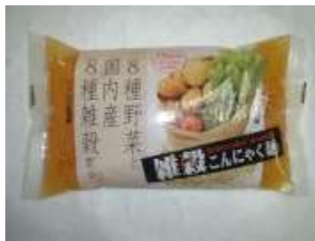
K017 7 oz x 10 山藥麵條-蘿蔔 (10M) ISHIBASHIYA YAM NOODLE CARROT (KONNYAKU NOODLE)