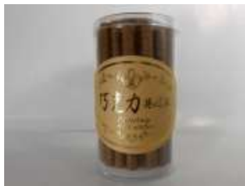
HT027 7.76 oz x 12 @傅林卷心酥-巧克力 FULIN ROLLED BISCUIT - CHOCOLATE