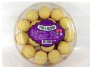
HT060 16.58oz x 12 @友賓小鳳梨酥-芋頭口味 PINEAPPLE COOKIE - TARO