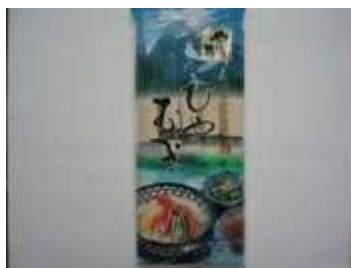
K078 14.1 oz x 20 乐市面线 (24M) AOI DRIED WHEAT NOODLE-(M) (KOHBOH HIYAMUGI)