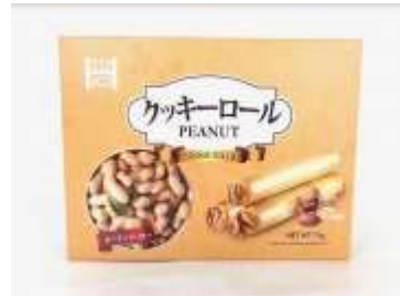
HT130 2.64OZ X 24 花生醬甜心爆爆捲(15M) TOKO PEANUT COOKIE ROLLS