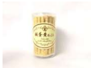
HT028 7.76 oz x 12 @傅林卷心酥-咸蛋黃口味 FULIN ROLLED BISCUIT - SALTY YOLK FLAVOR