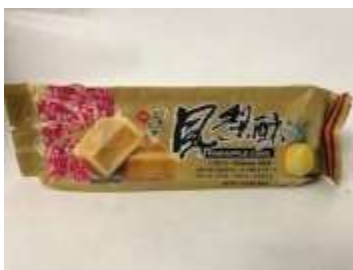
HT106 7OZ X 20 @長松條裝台灣好味鳳梨酥(20入) CHANG SONG ORIGINAL PINEAPPLE COOKIE