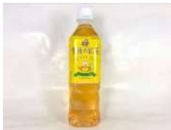
I011 500ML x 24 麒麟午后红茶 (柠檬)500ml (9M) KIRIN SOFT DRINK-AFTERNOON TEA-LEMON (S)