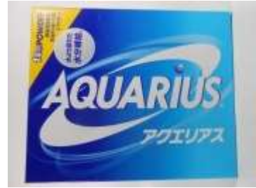
I100 1.69oz x 5 x 6 可樂健康飲料粉(18M)