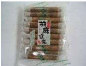
H197 6oz x 12 x 2 @胡麻道樂16P KIKUSENDO WHEAT CRACKER- SESAME (GOMADORAKU 16P)