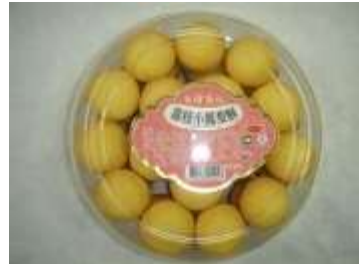
HT056 16.58oz x 12 @友賓小鳳梨酥-荔枝口味 PINEAPPLE COOKIE - LYCHEE