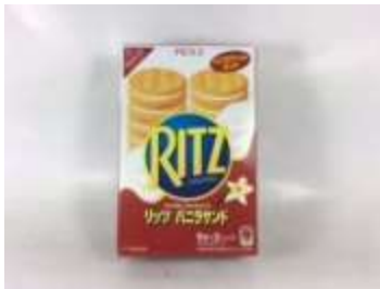
H458 5.64 oz X 10 香草夾心餅乾(12M)