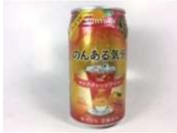
I184 350ml x 24 三多力无酒精饮料 - 香橙 (12M) SUNTORY SOFT DRINK-ORANGE FLAVOR