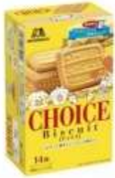
H452 4.2oz x 5 x 8 森永精選餅乾 (9M)