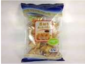
H187 9.5oz x 9 @切片千層糕 MARUKIN BAUM CAKE- CUT 10pc(ATSUGIRI)