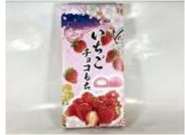
H081 8.25oz x 21 @精機草莓巧克力大福 SEIKI MOCHI- STRAWBERRY CHOCOLATE DAIFUKU 310G