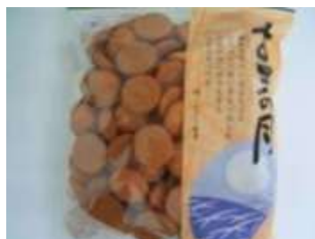
H058 4.9 oz x 24 @一口碎饼(大)

KOMADORI BAKED WHEAT BISCUIT (FURUSATO NO TSUKI)