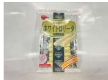
H033 3.4 oz x 12 x 2 34873 波本白巧克力牛奶蛋卷(12M)

^BOURBON BAKED WHEAT COOKIE (WHITE ROLLITA)