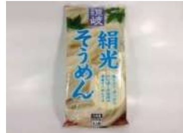
K124 21.1oz x 20 讃岐絹光寿面 (24M)

SANUKI SHISEI DRIED NOODLE (KINUTSUYA SOMEN)