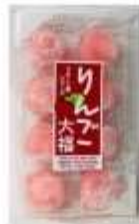
H010 7oz x 12 x 2 @苹果大福饼