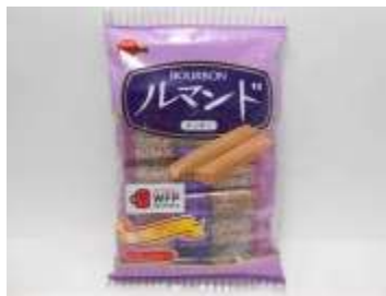
H031 3.1 oz x 12 x 2 35417 波本小蛋卷(12M)