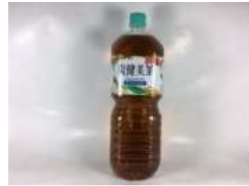
I133 2L X 6 可樂 爽健美茶2L (12M)