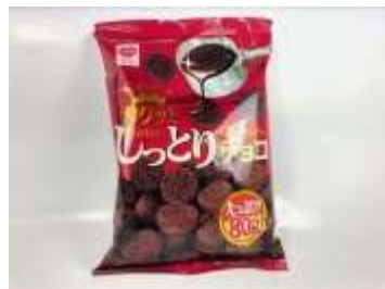
H326 2.82oz x 15 RISKA 烤麥餅乾-巧克力(6M) ^RISKA BAKED WHEAT BISCUIT - CHOCOLATE