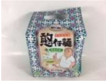
KT031 (3.88oz x4) x 12 @憨仔面-葱香炸酱味