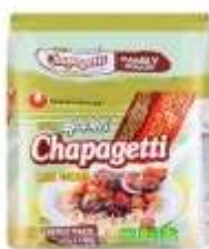
KK009 (4.47OZ X 4) X 4 101002651農心雜醬麵(12M)