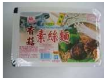
KT006 10.5 oz x 12 @福慧香菇素絲麵 VEGETARIAN INSTANT FINE NOODLE (MUSHROOM) 5P