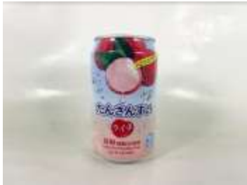
IT090 330 ML X 24 荔枝風味气泡水(24M) LYCHEE FLAVOR SPARKLING WATER