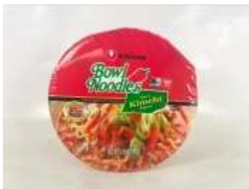
KK026 3.03 oz x 12 101002099 農心泡菜碗麵(12M) BOWL NOODLE SPICY KIMCHI SLEEVE (12PK)