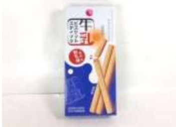
HT072 1.06oz x 36 @長松松屋鮮奶棒(奶蛋素)紙盒裝 CHANG SONG MATSUYA BISCUIT- (BOX)MILK FLAVOR