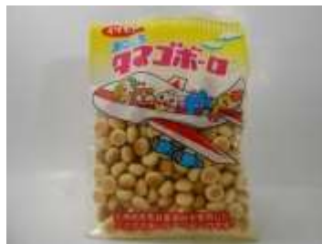
H374 2.6oz x 15 x 2 @ 營養小饅頭 (小動物飛機) IWAMOTO MAGOKORO EGG BORO BISCUIT