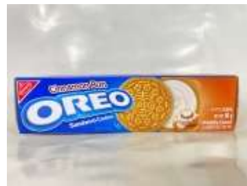
HK030 2.82oz x 24 奧利奧桂香夾心餅乾(12M) NABISCO OREO SANDWICH COOKIE(CINAMON)