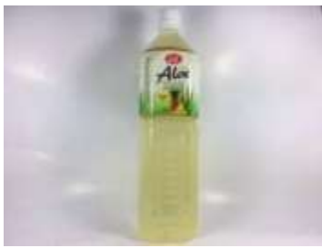
IK037 1.5L x 12 韓國蘆薈寶鳳梨1.5L(24M) L&L ALOE DRINK - PINEAPPLE(1.5L)