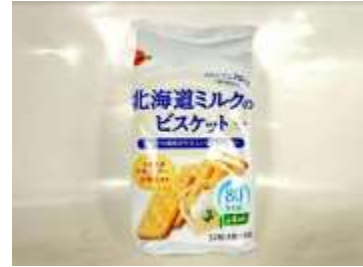
H021 5.1OZ X 6 X 2 35344波本北海道牛奶餅乾 ( 10M )