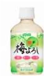
I227 280ML X 24 DYDO梅子果汁12M DYDO PLUM JUICE