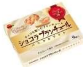
H364 1.41OZ X 10 X 12 波本白巧克力餅乾-香草(12M) ^BOURBON-CHOCOLAT BLANCHUL VANILLA WHITE