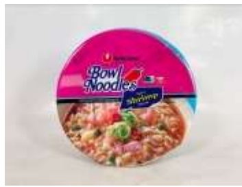
KK030 3.03 oz x 12 101002102農心辣味蝦碗麵(12M) N.S. BOWL NOODLE SPICY SHRIMP (12PK)