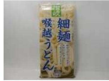
K121 21.1 oz x 20 讃岐細麵 (細麵喉越) (12M)