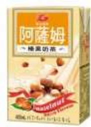
IT045 (400ML x 6) x 4 阿薩姆榛果奶茶 12M