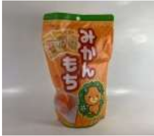
H063 4.58oz x 12 @精機橙子麻糬 SEIKI MOCHI - ORANGE