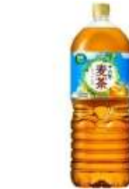
I070 2L x 6 朝日十六茶麥茶2L (12M) ASAHI SOFT DRINK- TEA(JYUROKU CHA MUGICHA) (L)