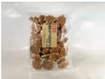
HT131 3.52oz x 24 @台湾名物鸡蛋松煎饼 TOKO EGG WAFFLE ORIGINAL FLAVOR