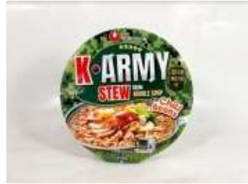
KK100 4.02oz x 6 101004135 農心K軍杯麵 NONGSHIM BIG BOWL K-ARMY STEW 6PK