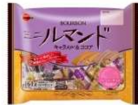
H342 5.8oz x 12 波本 威化-焦糖, 可可(12M) ^BOURBON MINI LUMOND FS CARAMEL & COCOA COOKIE