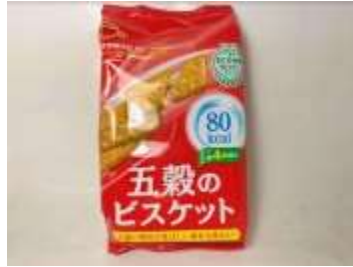
H020 4.9 oz x 6 x 2 波本五穀蘇打餅 (8M)