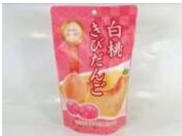
H070 4.58oz x 12 @精機桃子大福 SEIKI MOCHI - PEACH FLAVOR