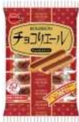
H035 3.8 oz x 12 x 2 35419 波本巧克力蛋卷(12M)

^BOURBON BAKED WHEAT COOKIE CHOCO(CHOLIERA)