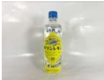
I032 500ML x 24 麒麟檸檬水(7M)