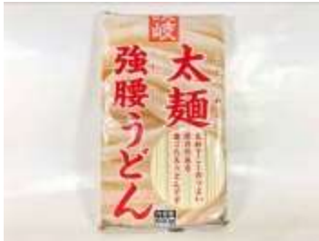
K122 21.1 oz x 20 讃岐烏冬麵 (太麵強腰) (12M)