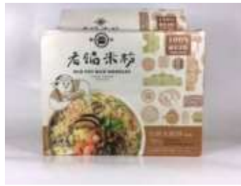
KT029 (2.12oz x 4) x 6 @老锅米粉-炒米粉风味 4入