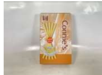
HT116 1.23oz x 24 CONNIE'S香蕉牛奶巧克力味棒(18M) TOKO BANANA MILK CHOCOLATE STICKS