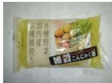
K016 7 oz x 10 山藥麵條-南瓜 (10M)