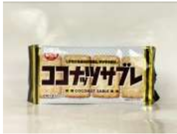
H252 3.1oz x 12 日新CISCO'S 椰果餅乾 (12M) NISSIN CISCO'S COCONUT SABLE BISCUITS