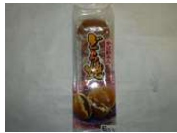
H005 9.8 oz x 12 @蛋糕-甜红豆

HIYOSHI PASTRY - SWEET RED BEAN (DORAYAKI)