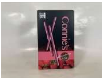
HT121 1.23oz x 24 CONNIE'S 草莓牛奶巧克力味棒(18M) TOKO STRAWBERRY MILK CHOCO STICK