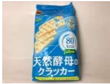
H017 5.1 oz x 6 x 2 天然酵母餅 (8M)