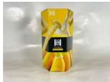
HT122 2.46oz x 40 日式煎捲-香蕉牛奶巧克力風味(18M) TOKO ROAST COOKIE ROLL- BANANA MILK CHOCO FLAVOR