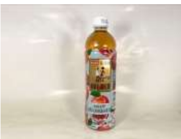
IT052 580ml X24 阿薩姆蘋果石榴紅茶(12M)