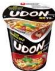
KK042 2.01oz x 6 101003360農心甜不辣烏冬杯麵(10M) N.S. TEMPURA UDON CUP (6PK)