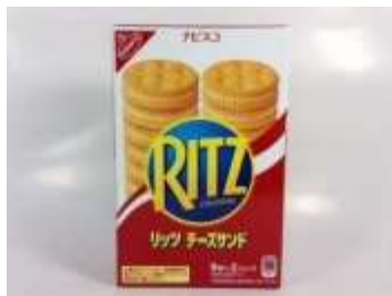
H182 5.64oz x 10 4274943 芝士夾心餅乾(13M) NABISCO RITZ BISCUIT- CHEESE