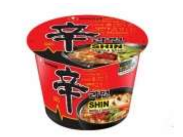
KK028 4.02 oz x 6 101001850 農心辛碗面(12M) N.S. SHIN BIG BOWL (6PK)