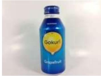
I090 400ML x 24 三多力柚子果汁 (8M)