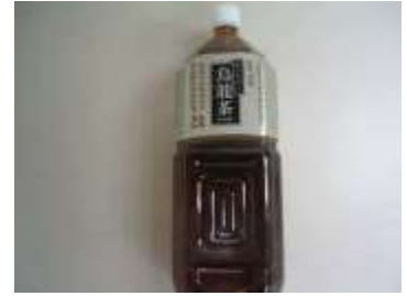
I004 2L x 6 三多力乌龙茶 (12M) SUNTORY SOFT DRINK - TEA - OOLONG TEA (L)