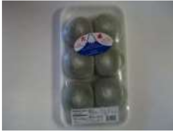
HA012 10 oz x 20 @大福餅-綠 *SAKURAYA DAIFUKU -GREEN