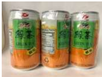
IT035 (340ml x 6) x 4 茶之鄉蜂蜜綠茶 (罐裝) (24M)