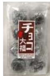
H015 7oz x 12 x 2 @巧克力大福饼

KUBOTA BAKED SOFT CAKE - CHOCOLATE FLAVOR