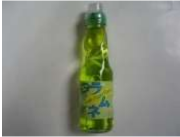
I049 200ML x 30 987 @青蘋果彈珠汽水 FUJI SODA - GREEN APPLE (RAMUNE)