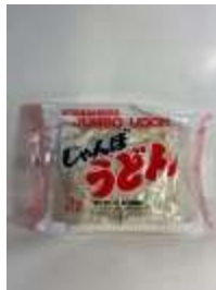
K037 21.1 oz x 12 @乌龙面 (家庭装) KS JUMBO FRESH FLOUR NOODLE