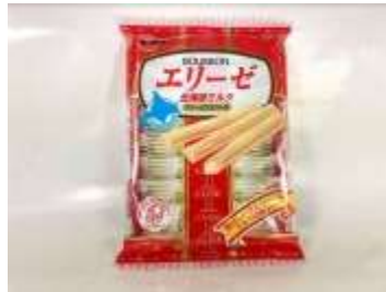
H038 2 oz x 12 x 2 35421 波本威化-香草夾心(12M)