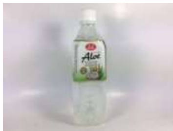
IK034 500ml x 20 韓國蘆薈實椰果500ml (24M)