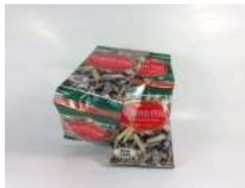
G019 1.05oz x 20 泉屋 五連小魚乾 - 杏仁(6M) IZUMIYA 5REN DRIED FISH-ALMOND (5x MINI PK)