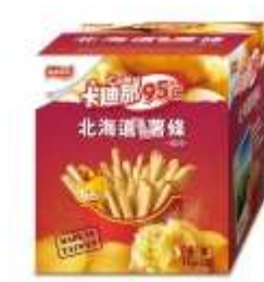
FT073 3.17oz x 12 卡迪那95°C薯條鹽味(10M) L.H.CADINA 95°C POTATO CHIPS-SALT