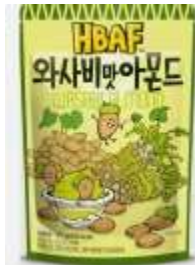
GK030 4.23oz x 20 韓國芥末杏仁(12M)