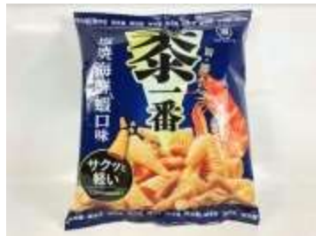
FT110 3.45 oz x 10 湖池屋黍一番 盐烧海鮮蝦(8M)

KOIKEIYA CORN CHIPS -SEAFOOD SHRIMP FLAVOR