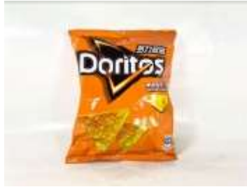
FT044 1.69 oz x 12 D08 多力多滋薯片-黄金起司口味(8M) DORITOS CHIPS - GOLDEN CHEESE FLAVOR