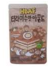
GK037 4.23oz x 20 韓國提拉米蘇杏仁(18M)