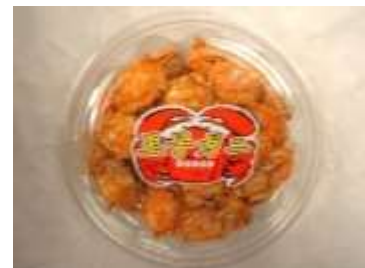
G112 1.2oz x 25 @玉子蟹 TAKUMA DRIED CRAB (TAMAGO GANI DT)