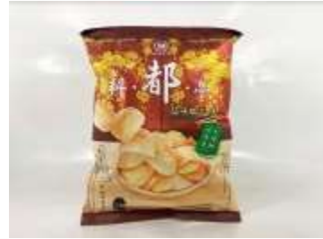
FT029 2.12oz X 10 湖池屋平切洋芋片-蒜味虾口味(8M)

KOIKEIYA POTATO CHIPS- GARLIC SHRIMP FLAVOR