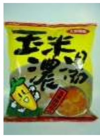
FT061 1.76 OZ X 10 @大同玉米濃湯休閒點心 DA-TONG CORN SOUP SNACK