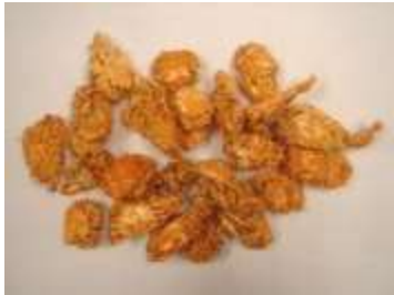
G001 211.6oz X 1 @螃蟹 SAKURA SHOKUHIN DRIED CRAB (CRAB GANI DT/5kgs)