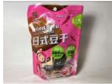
GT085 5.36oz x 40 福記日式素豆干 - 辣味(12M)