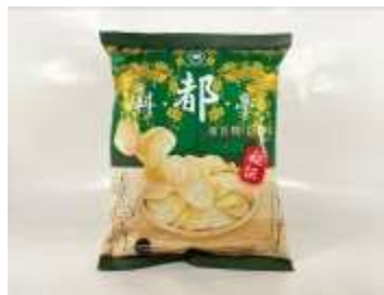
FT025 2.12 oz x 10 湖池屋平切洋芋片-海苔焗盐口味(8M)

KOIKEIYA POTATO CHIPS- SEAWEED SALT FLAVOR