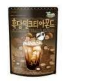
GK017 6.70OZ X 20 韓國黑糖奶茶杏仁(18M)

^TOM'S ALMOND (BLACKSUGAR MILKTEA FLAVOR)