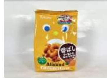
G026 2.11oz x 12 x 2 11398东鳩玉米果-杏仁焦糖 (6M) TOHATO CARAMEL CORN - ALMOND CARAMEL