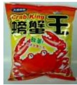
FT062 1.76 OZ X 10 @大同螃蟹王 DA-TONG CRAB KING FLAVOR CRACKER