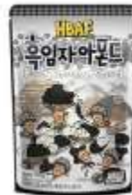
GK041 4.23oz x 20 韓國黑芝麻杏仁(18M)