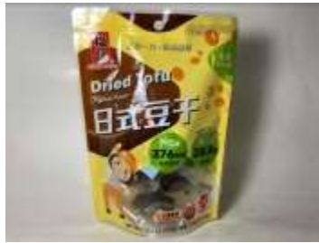
GT084 5.36oz x 40 福記日式素豆干 - 原味(12M)