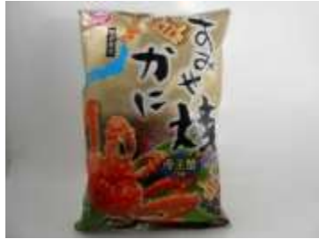
FT063 3.17 OZ X 12 @炭烤螃蟹(帝王蟹口味) BBQ KING CRAB FLAVORED BISCUIT