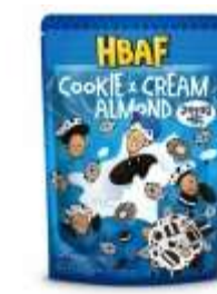
GK036 4.23oz x 20 韓國奧利奧味杏仁(18M)