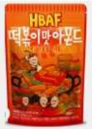
GK032 4.23oz x 20 韓國香辣年糕杏仁(18M)