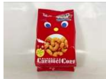
G021 2.4oz x 12 x 2 11397东鳩奶油玉米果 (6M) 大 TOHATO CORN PUFF-ORIGINAL (CARAMEL)