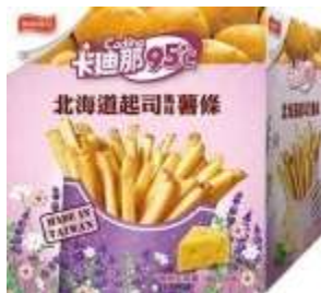
FT114 3.17oz x 12 卡迪那95°C北海道起司風味薯條(10M)

L.H.CADINA 95°C FRIES HOKKAIDO STYLE CHEESE FLAVOR