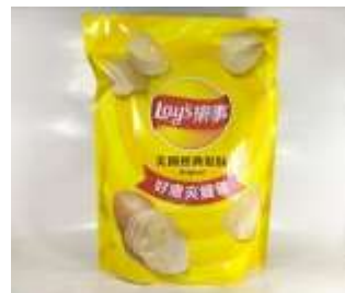
FT156 8.11oz x 6 L241乐事夹链子包-经典原味(8M) LAY'S POTATO CHIPS ZIPPER BAG- ORIGINAL