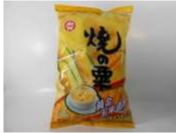
FT066 3.17OZ X 12 @玉米(燒栗)脆果-黃金玉米濃湯口味(9M) HHC CORN PUFF-CORN SOUP FLAVOR