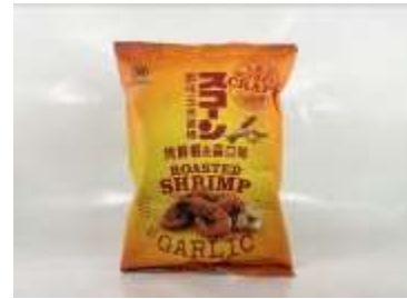
FT107 2.82 oz x 10 湖池屋烤鮮蝦蒜口味 酥味玉米脆棒(8M)

KOIKEIYA CORN STICK ROASTED GARLIC SHRIMP