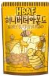
GK029 4.23oz x 20 韓國蜂蜜黃油杏仁(12M)