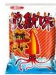
FT032 1.76oz x 10 @華元真魷味 - 香辣口味