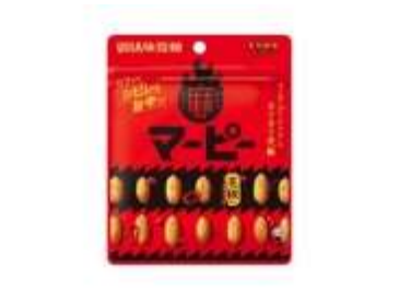
G077 1.41oz x 10 x 8 UHA麻辣花椒花生(8M) UHA MAPII SPICY PEANUTS SNACKS