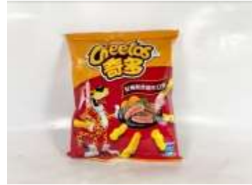
FT143 1.94OZ X 12 C57 奇多安格斯烤牛口味(8M) CHEETOS ANGUS ROAST BEEF FLAVOR