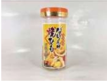
G055 3.17 oz x 20 @烤串黄油扇贝 (锅) 90g GRILLED SCALLOP BUTTER (POT) 90g