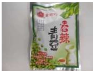
GT131 7.05oz X 20 @翁財記青豆-香辣