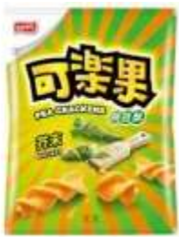
FT024 2.01oz x 12 聯華可樂果 - 芥末(10M)