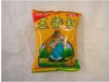
FT042 1.76oz x 10 @華元玉黍叔-甜辣口味 H.Y. CORN CONES-SWEET & SPICY FLAVOR