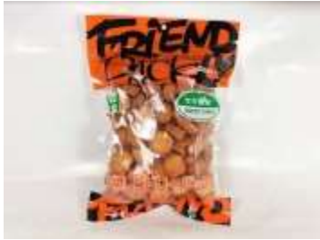
FTI008 8oz x 20 @朋友集合ORANGE TOKO RICE CRACKER- NEW FRIED HOT OVAL