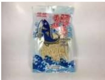
GT053 1 oz x 100 @珍珍鱈魚香絲