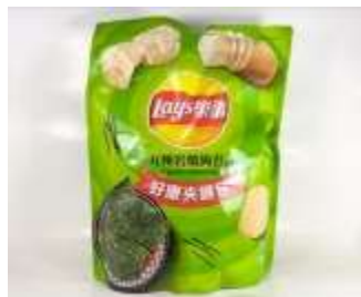
FT155 8.11oz x 6 L242乐事夹链包-岩烧海苔(8M) LAY'S POTATO CHIPS ZIPPER BAG- KYUSHU SEAWEED