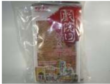
GT079 2.80 oz x 50 @珍珍 戲院口鱿鱼

JAN JAN PREPARED ROLLED SQUID(NATURAL STYLE)