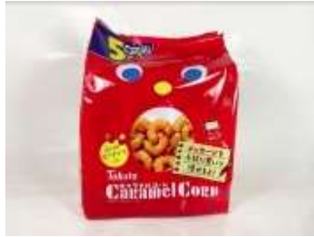
G022 (0.66oz x 5) x 12 东鳩奶油玉米果 (5PK 小) (6M) TOHATO CORN PUFF - ORIGINAL (CARAMEL CORN) (5P)