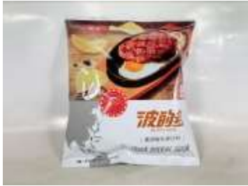
FT160 1.2oz x 10 @華元洋芋片黑胡椒牛排口味

H.Y. POTATO CHIPS BLACK PEPPER STEAK FLAVOR