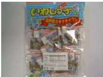
G013 1.3oz x 12 @健康小鱼干 IZUMIYA DRIED FISH (IWASHIKKO)