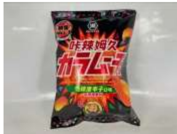
FT070 2.32oz X 10 咔嚓姆久洋芋片-辣味(8M) KOIKEYA POTATO CHIPS-SPICY