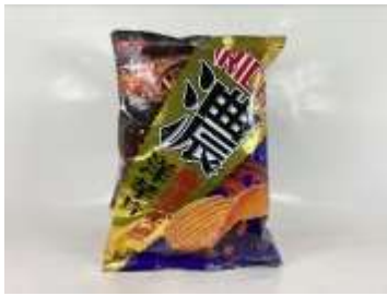
FT038 2.69 oz x 12 @華元波的多洋芋片-浓厚麻辣老火锅风味 H.Y. POTATO CHIPS- SPICY HOTPOT FLAVOR