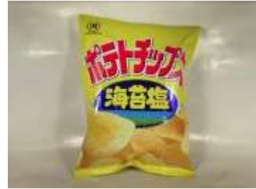
FT068 2.33oz X 10 湖池屋 洋芋片-鹽味(8M) KOIKEYA POTATO CHIPS-SALT