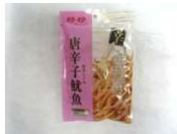
GT062 1.58 oz x 20 @珍珍唐辛子鱿鱼