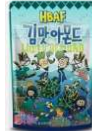
GK034 4.23oz x 20 韓國紫菜杏仁(12M)