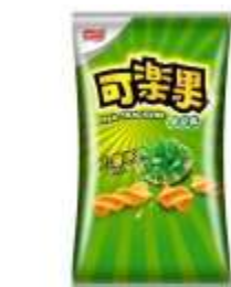
FT072 14.11oz x 8 可樂果家庭裝-九層塔(10M) L.H.KOLOKO(PEA CRACKER)-BASIL FAMILY PACK