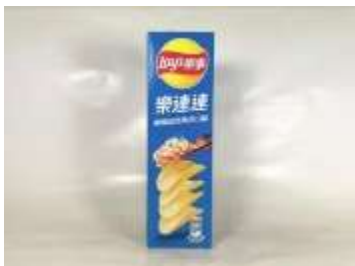
FT089 2.12 OZ X 15 S110 台灣樂事(盒裝)和风蒜香海老口味(8M)

LAY'S STAX POTATO CHIPS-GARLIC SHRIMP FLAVOR(BOX)