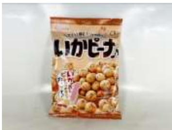
G088 3.14 oz x 12 x 2 01491 春日井鱿鱼花生 (6M)-STICKER KASUGAI SQUID PEANUT CRACKER(IKA PEANA)