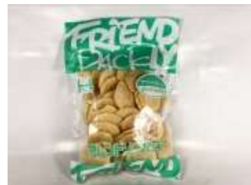
FTI004 4.23oz x 20 @朋友集合LIGHT GREEN