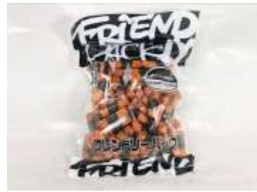
FTI007 8oz x 20 @朋友集合BLACK TOKO RICE CRACKER CALIFORNIA ROLL NORIMAKI