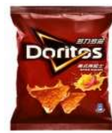
FT059 1.69oz x 12 D13 多力多滋薯片-美式辣起士脆饼(8M) DORITOS CHIPS -SPICY NACHO FLAVOR