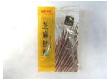
GT052 1.76 oz x 20 x 2 @珍珍芝麻鱈絲