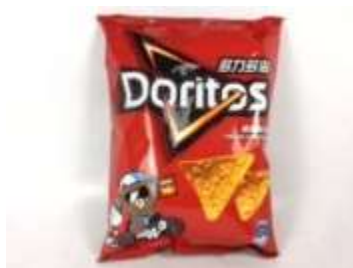
FT057 1.69oz x 12 D02 多力多滋薯片-超浓起司(8M) DORITOS CHIPS - NACHO CHEESIER FLAVOR