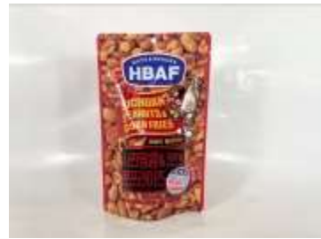
GK028 4.23oz x 20 韓國四川花生玉米薯條(12M)