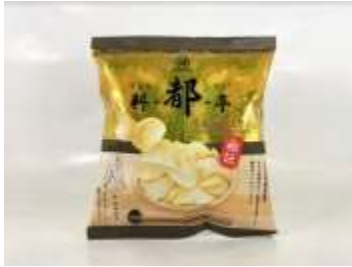
FT027 1.02 oz X 10 湖池屋平切洋芋片-京风高汤口味(8M)

KOIKEIYA POTATO CHIPS-BEIJING STYLE SOUP FLAVOR