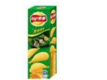
FT090 2.11 OZ X 15 S81台灣樂事(盒裝)海苔壽司洋芋片(8M)

LAY'S STAX POTATO CHIPS-SEAWEED SUSHI FLAVOR(BOX)