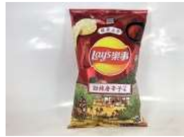
FT159 2.99oz x 12 L264乐事劲辣唐辛子口味大包(8M)

LAY'S POTATO CHIPS- SPICY CHILLI PEPPER FLAVOR