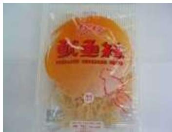
GT059 7 oz x 40 @辣味珍珍鱿鱼丝 (大)