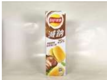
FT087 2.12 OZ X 15 S108台灣樂事(盒裝)海盐松阪猪口味(8M)

LAY'S STAX POTATO CHIPS-PORK FLAVOR (BOX)