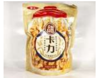
FT111 7.93oz x 6 @华元甜卡力 - 大

H.Y. KA LI CRISPY SNACK SWEET FLAVOR - L