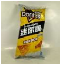
FT092 1.9 oz x 12 D57 多力多滋迷你脆-香脆雞口味 (8M)

DORITO'S MINI CORN CHIPS - PEPPER CHICKEN FLAVOR