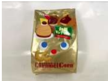
G028 2.29oz x 12 x 2 11377东鳩玉米果 - 栗子 (6M) TOHATO CARAMEL CORN PUFF -MONT BLANC