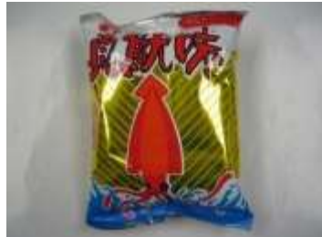
FT031 1.76oz x 10 @華元真魷味 - 原味