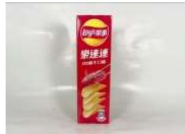
FT088 2.1 OZ X 15 S88台灣樂事(盒裝)A5和牛口味(8M)

LAY'S STAX POTATO CHIPS-A5 BEEF FLAVOR (BOX)