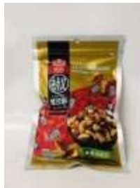
GT129 8.47oz x 12 @翁財記蠶豆-黑胡椒