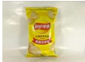
FT153 4.19oz x 12 L238 台灣樂事洋芋片分享包-经典原味(8M) LAY'S POTATO CHIPS FAMILY BAG- ORIGINAL