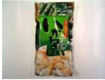
G165 0.7oz x 10 x 10 @小島魷魚絲