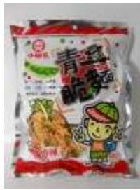
GT017 8.4 oz x 12 @小班長青豆脆麵-香辣

HHC NOODLE & GREEN PEA CRACKER- SPICY FLAVOR