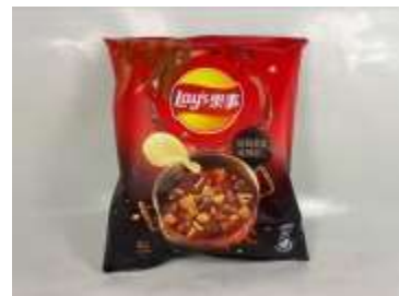
FT080 1.2OZ X 12 L296台灣樂事洋芋片-秘制麻辣鍋口味(8M)

LAY'S POTATO CHIPS - SECRET SPICY POT FLAVOR