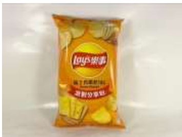
FT154 4.19oz x 12 L240 台湾乐事分享包瑞士香浓起司 (8M) LAY'S POTATO CHIPS FAMILY BAG- CHEESE FLAVOR