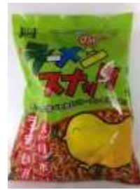
GT018 7.8oz x 12 @鷄絲麵 - 海苔