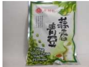
GT130 7.05 OZ X 20 @翁財記青豆-蒜香