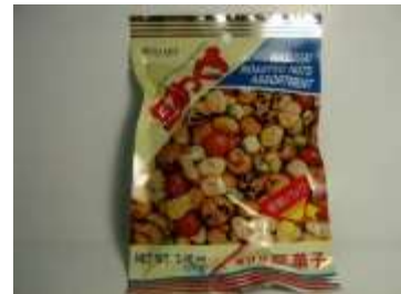
G035 2.01oz x 12 x 2 01196春日井什豆子 (12M) KASUGAI PEA/NUTS CRACKER