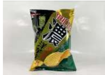
FT035 2.69 oz x 12 @華元波的多洋芋片 - 浓厚海苔盐之花口味