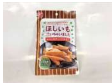
G015 2.8oz x 10 口达番薯条--烤 (6M) KODA DRIED SWEET POTATO - BAKED