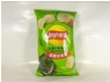
FT145 4.19OZ X 12 L239 台灣樂事洋芋片分享包岩燒海苔(8M) LAY'S POTATO CHIPS FAMILY BAG- KYUSHU SEAWEED