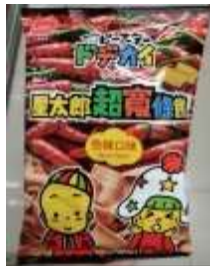
GT035 2.47OZ X 12 星太郎超寬條餅 - 勁辣(12M)

BABY STAR - SPICY FLAVOR THICK NOODLE SNACK