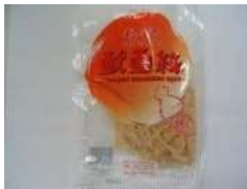
GT055 3 oz x 10 x 5 @珍珍魷魚絲 (中)