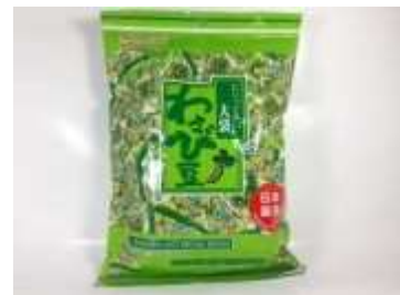
G039 8oz x 12 春日井芥末什锦豆 (12M) KASUGAI GREEN PEAS & BEANS HORSERADISH (JUMBO)