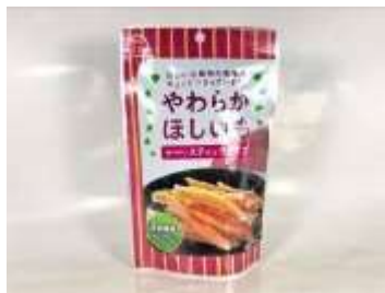
G014 3.5oz x 10 口达番薯条 (6M) KODA DRIED SWEET POTATO