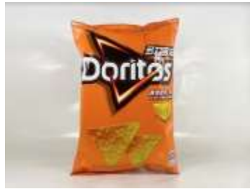
FT102 2.96oz x 12 D10 多力多滋薯片中包-黃金起司口味 (8M)