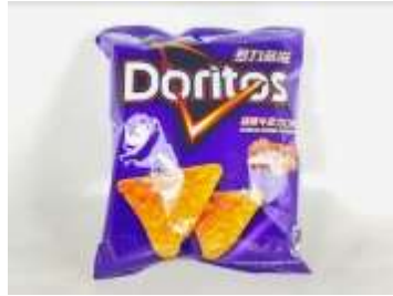
FT130 1.41oz x 12 D89多力多滋薯片-爆蒜牛排口味(8M) DORITOS CHIPS- GARLIC STEAK FLAVOR