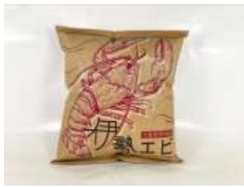
FT060 1.76oz x 10 @大同龙虾风味饼 DA-TONG CRACKER LOBSTER FLAVOR