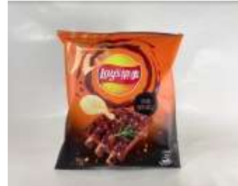
FT085 1.2 OZ X 12 L299台灣樂事薯片-熏烤猪肋排口味(8M)

LAY'S POTATO CHIPS- SMOKED PORK RIB FLAVOR