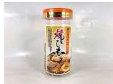
G054 3.35oz x 20 @烤串扇贝 (锅) 95g GRILLED SCALLOP(POT) 95G