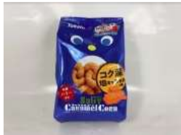
G067 2.36oz x 12 x 2 11399东鸠玉米果-咸焦糖味(8M) TOHATO CARAMEL CORN - SALTY CARAMEL