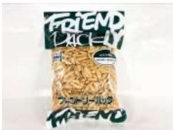
FTI002 8oz x 20 @朋友集合DARK GREEN

TOKO RICE CRACKER KAKINOTANE- WASABI+SEAWEED