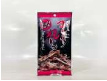
G168 0.30Z X 10 X 10 @燒魷魚點心