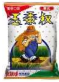
FT041 1.76oz x 10 @華元玉黍叔-漢堡口味 H.Y. CORN CONES-B.B.Q. FLAVOR