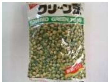
G037 9.48oz x 12 春日井青豆 (特大) (12M) KASUGAI GREEN PEAS (JUMBO)