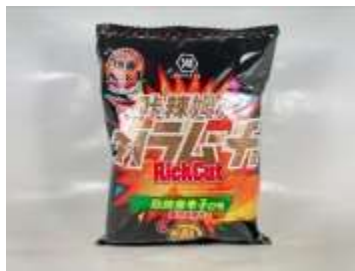
FT076 2.32oz X 10 咪辣姆久洋芋片-厚切劲辣唐辛子 (8M)