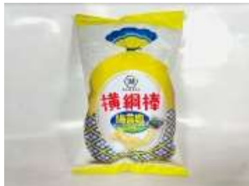
FT109 1.55oz x 10 湖池屋 橫綱棒-海苔鹽(8M)

KOIKEIYA YOKOHAMA STICKS- SEAWEED SALT FLAVOR