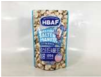
GK026 4.23oz x 20 韓國烤咸花生(12M)