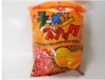
GT020 7.80oz x 12 @雞絲面 - 原味