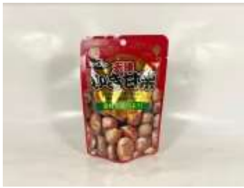
G118 2.46 oz x 15 天津板栗 (12M)