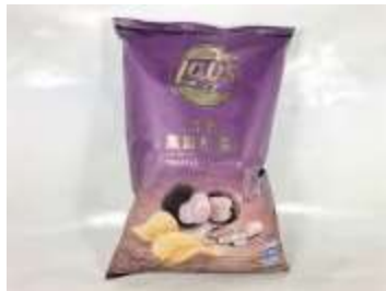
FT048 2.47oz x 12 L205台灣樂事法國黑鑽松露洋芋片(8M) LAY'S POTATO CHIPS-TRUFFLE FLAVORED CHIPS