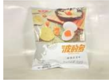
FT163 1.2oz x 10 @華元洋芋片咸蛋黄口味

H.Y. POTATO CHIPS SALTY EGG SAUCE FLAVOR