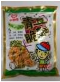
GT016 7.05 oz x 12 @小班長青豆脆麵-蒜香

HHC NOODLE & GREEN PEA CRACKER- GARLIC FLAVOR