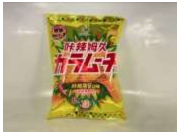
FT069 1.97oz X 10 咔嚓姆久洋芋片-辣海苔味(8M) KOIKEYA POTATO CHIPS-SPICY SEAWEED