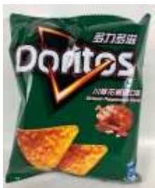
FT056 1.69oz X 12 D71多力多滋薯片-川味花椒雞口味(8M) DORITOS CHIPS - SICHUAN PEPPERCORN CHICKEN FLAVOR