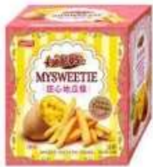
FT075 3.17oz x 12 卡迪那95°C 番薯條 (10M)