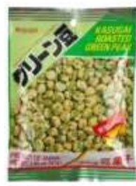
G008 2.57 oz x 12 X 2 春日井青豆 (12M)