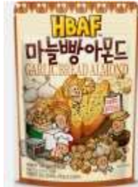
GK033 4.23oz x 20 韓國大蒜麵包杏仁(12M)