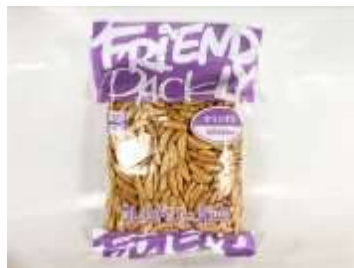
FTI003 8oz x 20 @朋友集合PURPLE