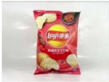
FT101 2.1oz x 12 L263 台灣樂事中-勁辣唐辛子口味(8M)

LAY'S POTATO CHIPS MID- SPICY CHILLE FLAVOR