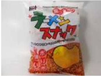
GT019 7.80oz x 12 @鷄絲麵 - 黑胡椒