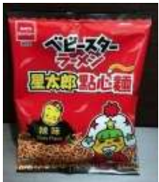
GT031 2.61 oz x 15 1260 星太郎點心面-辣味(12M)

BABY STAR SPICY FLAVOR CRISPY NOODLE SNACK