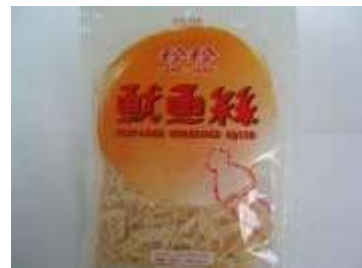
GT056 7 oz x 40 @珍珍魷魚絲 (大)