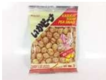
G089 2.18oz x 12 x 2 01207 春日井鱿鱼花生 (12M) 英文版 KASUGAI EX SQUID PEANUT CRACKER (IKA PEANA)