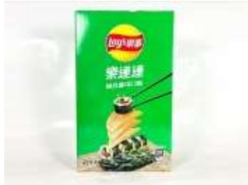
FT084 3.59oz x 12 FYS台灣樂事洋芋片-海苔2包入(8M)