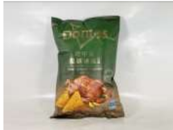
FT165 3.8oz x 12 D56多力多滋薯片地中海风味烤鸡(8M)