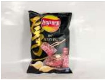
FT123 2.10Z X 12 L223 台灣樂事-神戸厚切牛排大包(8M) LAY'S POTATO CHIPS FAMILY BAG- KOBE STEAK FLAVOR