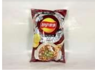
FT045 2.47OZ X 12 M96 台灣樂事洋芋片-麻婆烧豆腐大(8M) LAY'S POTATO CHIPS - LARGE SIZE MAPO TOFU FLAVOR