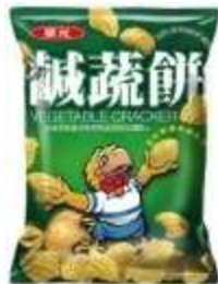
FT030 1.76 oz x 10 @華元鹹蔬餅