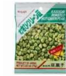
G009 2.36 oz X 12 X 2 春日井青豆 (芥末) (12M) KASUGAI GREEN- PEAS-JAPANESE HORSERADISH FLAVOR)