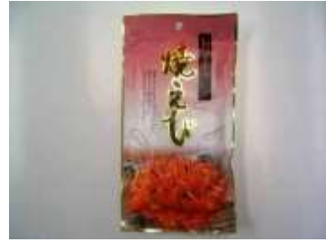
G166 0.35oz x 10 x 10 @小島香蝦燒