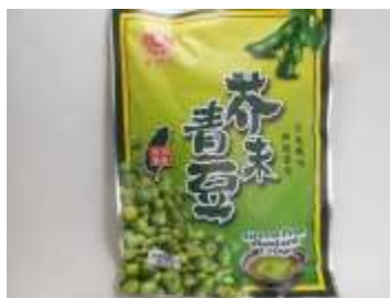
GT132 6.52 OZ X 20 @翁財記青豆-芥末