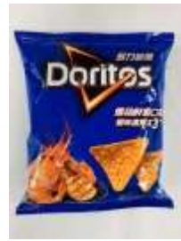
FT126 1.69oz x 12 D52 多力多滋薯片-爆蒜鮮蝦口味(8M) DORITOS CHIPS - GARLIC SHRIMP FLAVOR