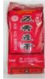
GT021 10.58 oz x 20 11110 德昌紅標豆干 (12M)