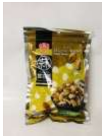
GT128 10.58oz x 12 @翁財記蠶豆-蒜頭味