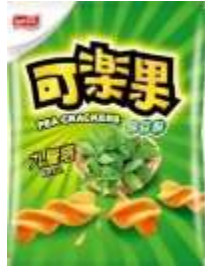
FT028 1.69oz x 12 聯華可樂果 - 九層塔(10M)