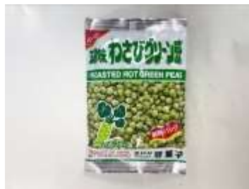
G038 8.92oz x 12 01036春日井青豆 (辣,特大) (12M) KASUGAI GREEN PEAS- HORSERADISH (JUMBO)