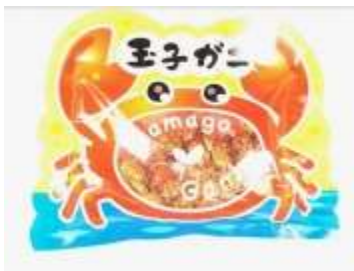
G052 2.46oz x 20 @玉子蟹 (专用袋) CRAB CRACKER 70G