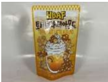
GK039 4.23oz x 20 韓國妃糖拿鐵杏仁(18M)