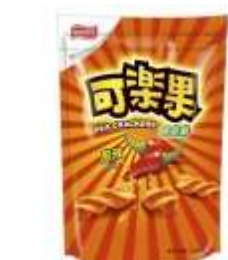
FT074 14.11oz x 8 聯華可樂果家庭裝-酷辣(10M) L.H. KOLOKO(PEA CRACKER)-SPICY FAMILY PACK