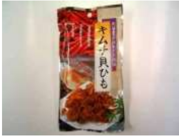
G164 0.56oz x 10 x 10 @小島扇貝卷邊

KOJIMA DRIED SCALLOP LIPS-SPICY (KIMUCHI KAIHIMO)