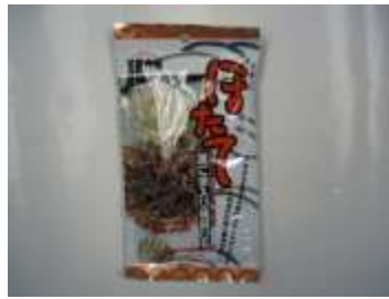
G155 0.56oz x 10 x 10 @小島燒貝捲

KOJIMA DRIED SCALLOP STRIP-SESAME (KAIHIMO)