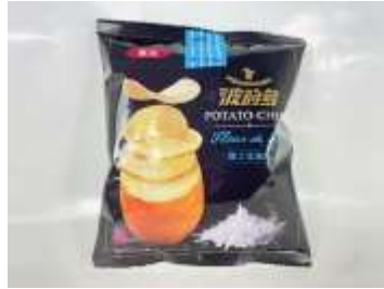
FT162 1.2oz x 10 @華元洋芋片盐之花口味