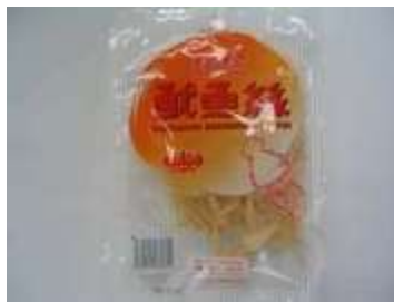
GT058 3 oz x 10 x 5 @辣味珍珍鱿鱼丝 (中)