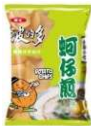
FT033 1.2oz x 10 @華元波的多洋芋片 - 蚵仔煎口味

H.Y. POTATO CHIPS - OYSTER OMELETTE FLAVOR