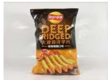
FT100 1.9oz x 12 台灣樂事-椒香嫩雞大波浪洋芋片中包(8M)

LAY'S POTATO CHIPS MID-PEPPERCHICKEN FLAVOR(RIDGE)