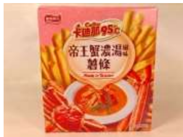
FT116 3.17oz x 12 卡迪那95°C 帝王蟹湯味薯條 (9M)

L.H.CADINA 95°C FRIES- KING CRAB BISQUE FLAVOR