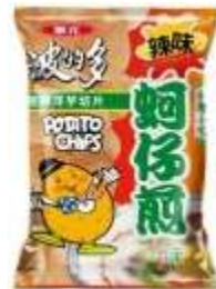
FT034 1.2oz x 10 @華元波的多洋芋片 - 辣味蚵仔煎

H.Y. POTATO CHIPS -SPICY -OYSTER OMELETTE FLAVOR