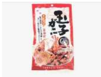
G053 1.58oz x 12 @玉子蟹45g CRAB CRACKER 45G