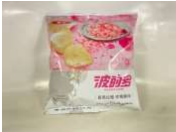
FT164 1.2oz x 10 @華元洋芋片玫瑰盐口味