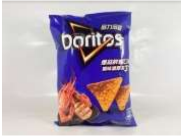
FT127 2.96oz x 12 D54 多力多滋薯片中包-爆蒜鮮蝦口味(8M) DORITOS CHIPS MID- GARLIC SHRIMP FLAVOR