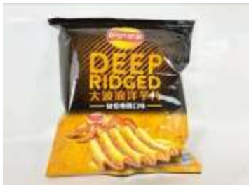
FT086 1.07oz x 12 R40台灣樂事椒香嫩鸡大波浪洋芋片(8M)

LAY'S POTATO CHIPS-PEPPER CHICKEN FLAVOR (RIDGE)