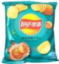
FT081 1.2oz x 12 L292台灣樂事薯片-极品香煎干贝口味(8M)