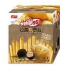
FT049 (0.63oz X 5)x12 联华卡迪那95C松露薯条-盒装5入(10M) L.H.CADINA 95C CHIPS- TRUFFLE FLAVOR-BOX 5P