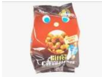
G030 2.53oz x 12 x 2 11112东鳩玉米果-苦味(6M) TOHATO CARAMEL CORN - BITTER