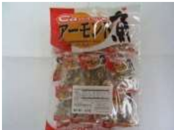
G064 1.8oz x 12 @泉屋小鱼豆 IZUMIYA DRIED FISH & ALMOND