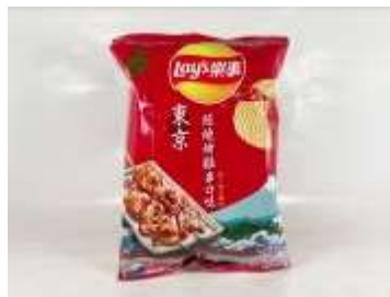
FT099 2.09oz X 12 M78 台灣樂事洋芋片中包-東京烤雞肉串口味 (8M)

LAY'S POTATO CHIPS MID-YAKITORI CHICKEN FLAVOR