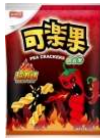
FT026 2.29 oz X 12 聯華可樂果 - 超激辣(10M)