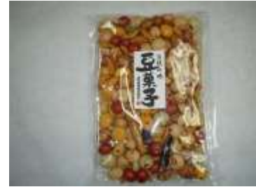
G063 8.8 oz x 15 @IMOTO 混合豆子煎餅 250G IMOTO MIX BEAN CRACKER 250g