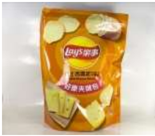
FT157 8.11oz x 6 L243乐事夹链包-香浓起司(8M)

LAY'S POTATO CHIPS ZIPPER BAG- CHEESE FLAVOR