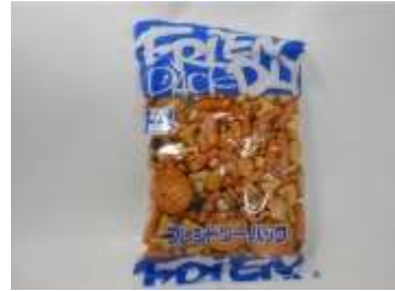
FTI010 8 oz x 20 @朋友集合 BLUE TOKO RICE CRACKER (FRIENDLY BLUE)