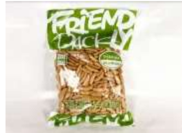
FTI001 8oz x 20 @朋友集合GREEN