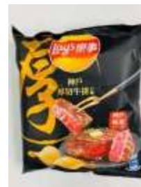
FT121 1.2oz X 12 L213 台灣樂事-神戶厚切牛排口味(8M)