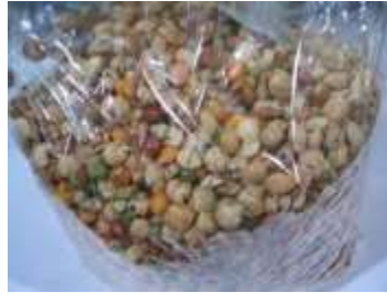
G024 15.4 lbs./ Tin @什豆子 IMOTO MIXED BEANS CRACKER(MAME KURABE)