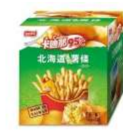
FT071 3.17oz x 12 卡迪那95°C薯條海苔(10M) L.H.CADINA 95°C POTATO CHIPS- SEAWEED