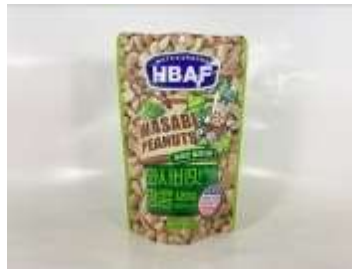
GK027 4.23oz x 20 韓國芥末花生(18M)