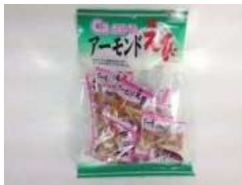
G016 1.69oz x 12 @泉屋 小干蝦 - 杏仁 IZUMIYA DRIED SHRIMP-ALMOND (15P)