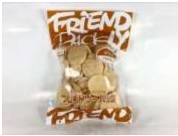
FTI005 4.23oz x 20 @朋友集合BROWN TOKO RICE CRACKER ARABE - TERIYAKI