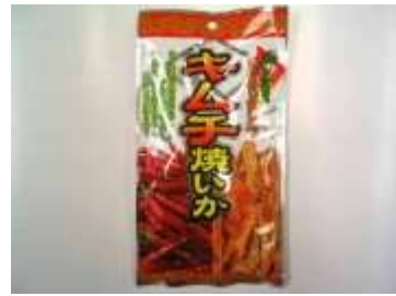
G163 0.39oz x 10 x 10 @小島辣味魷魚絲

KOJIMA DRIED SQUID-SPICY (KIMUCHI YAKI IKA)