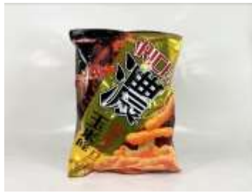
FT039 3.98oz x 12 @華元玉米条-重度辛口味 H.Y.CORN CHIPS- SUPER SPICY FLAVOR