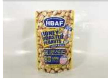
GK025 4.23OZ X 20 韓國蜂蜜烤花生(12M)