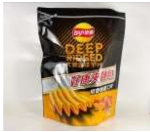
FT158 7.44oz x 6 R44乐事大波浪夹链包-椒香嫩鸡(8M)

LAY'S POTATO CHIPS ZIPPER BAG- PEPPERCHICKEN FLAVOR