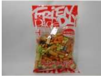
FTI009 8 oz x 20 @朋友集合(辣) RED TOKO RICE CRACKER (MILD HORSERADISH)RED