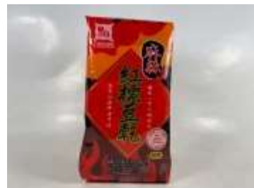
GT001 10.58 oz X 20 德昌豆干麻辣口味(12M)