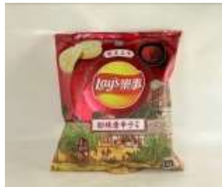
FT151 1.2 oz X 12 L262 乐事劲辣唐辛子口味(8M) LAY'S POTATO CHIPS- SPICY CHILLI PEPPER FLAVOR