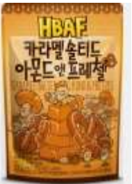
GK035 4.23oz x 20 韓國焦糖脆餅杏仁(12M)