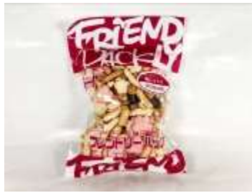
FTI006 5.29oz x 20 @朋友集合DARK RED TOKO RICE CRACKER-UME MIX