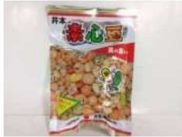
G061 3.5oz x 24 @井本 蔬菜豆 IMOTO MIXED BEAN CRACKER- MAME NO TSUDO!