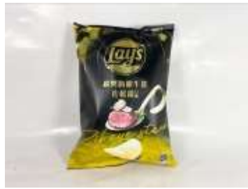
FT124 2.10Z X 12 L227 台灣樂事破烤助眼牛排左松露口 LAY'S POTATO CHIPS BIG BAG- RIB EYE STEAK FLAVOR