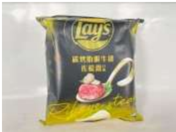
FT046 1.2oz X 12 L217台灣樂事碳烤助眼牛排左松露口味(8M) LAY'S POTATO CHIPS - RIB EYE STEAK FLAVOR