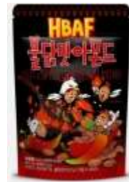
GK031 4.23oz x 20 韓國辣雞杏仁(12M)